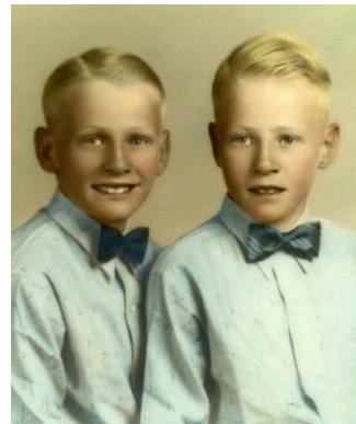
Clinton + Clifton