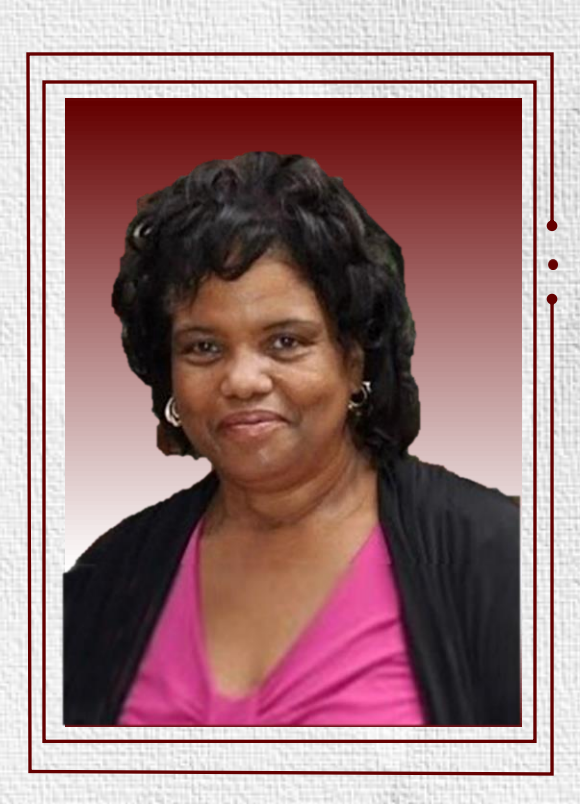
Sunrise Sunset October 15, 1956 - November 22, 2022