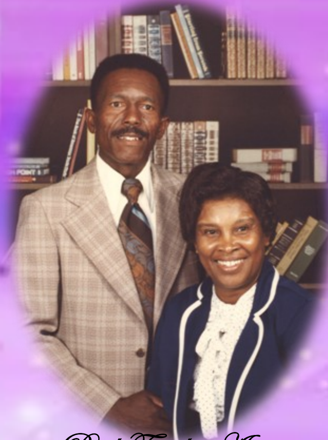
Back Together Again