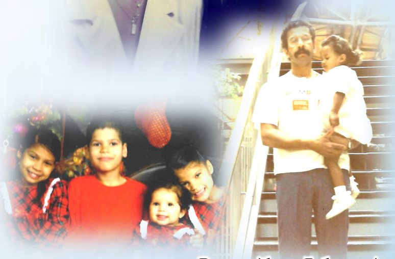
Dance with my Father again...