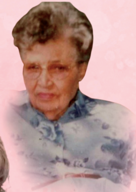
SUNSET January 19, 2023