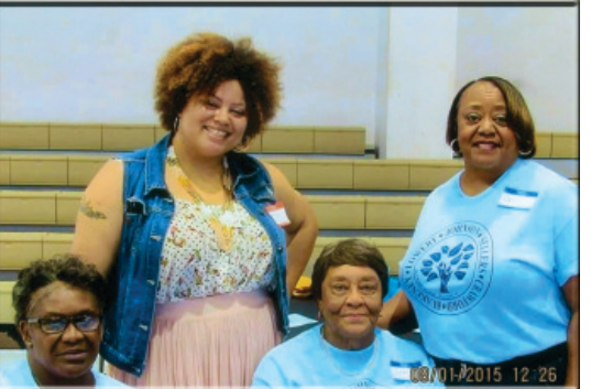
Mothers & Daughters