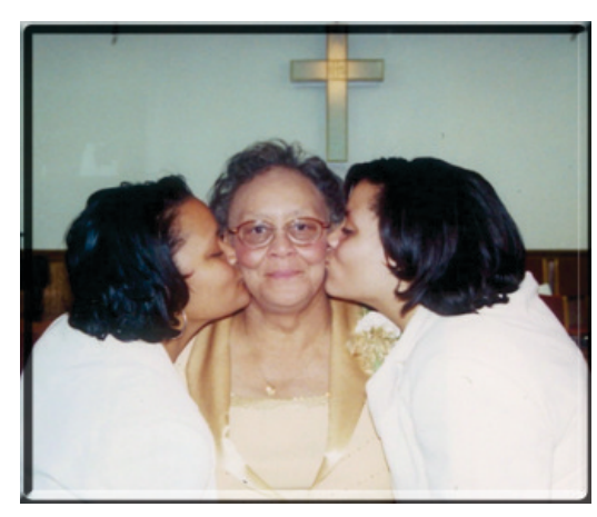
For Our Grandma

Active Floral Bearers Nieces & Oro Church Women