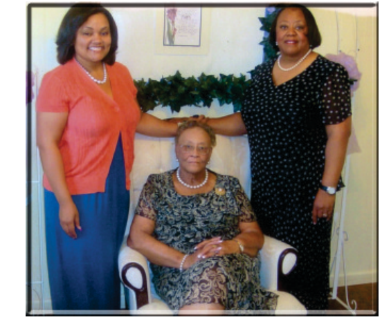
Mothers, Daughter Granddaughter