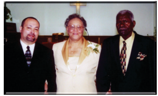
We're Walking and Standing in all of God's Glory!