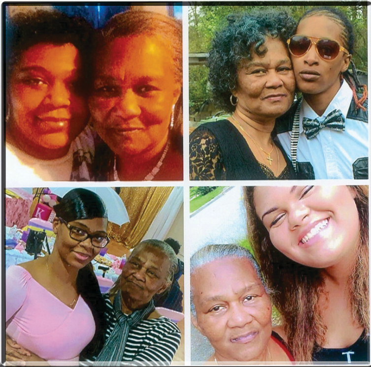
Casket Bearers Family and Friends