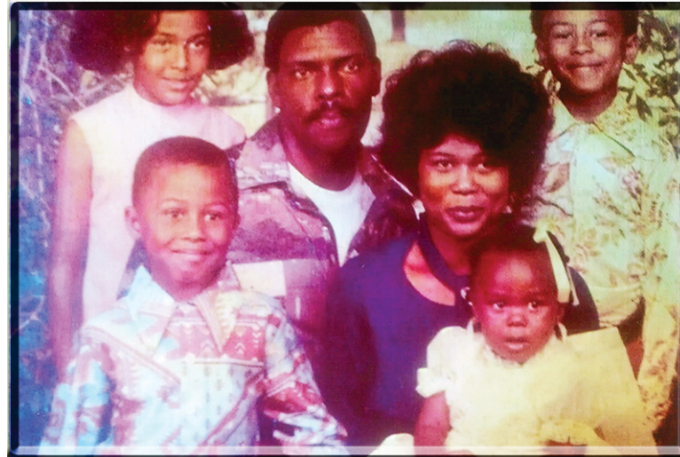
Floral Bearers Family and Friends