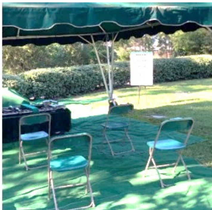
Social Distancing – Chairs, Outside Service