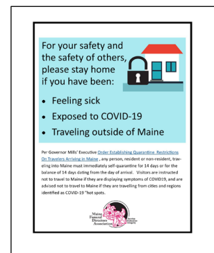
Stay Home Flyer