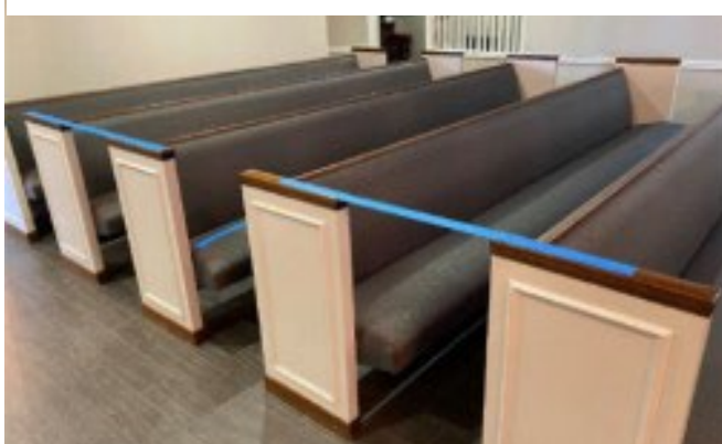
Social Distancing - Pews