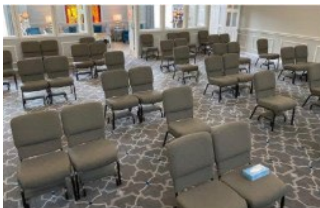
Social Distancing - Chairs