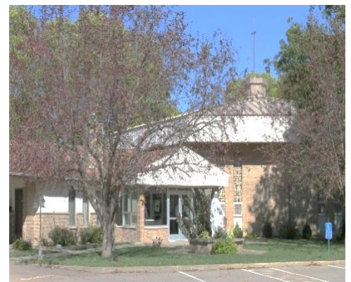
St. Ignatius Catholic Church 213 W. Franklin St, Spring Valley, MN 55975 Sunday Mass @ 10:30 AM

Sunday, July 17, 2022 16 th Sunday of Ordinary Time