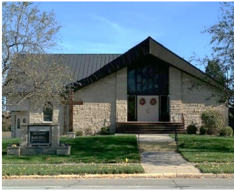
St. Patrick Catholic Church 436 W. Main St, LeRoy, MN 55951 Sunday Mass @ 8:30 AM