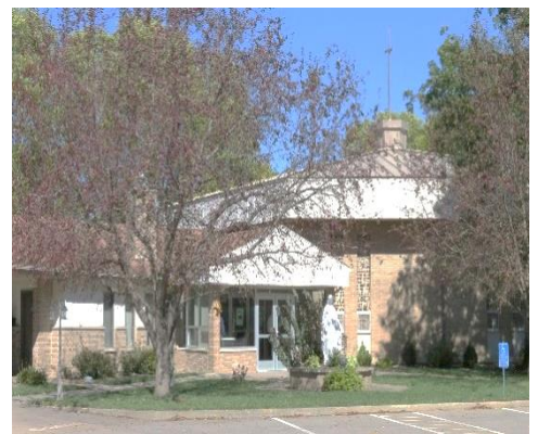
St. Ignatius Catholic Church 213 W. Franklin St, Spring Valley, MN 55975 Sunday Mass @ 10:30 a.m.