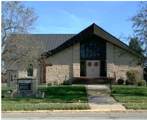
St. Patrick Catholic Church 436 W. Main St, LeRoy, MN 55951 Saturday Mass @ 5:00 p.m.