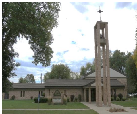
St. Finbarr Catholic Church 504 1 st St SW, Grand Meadow, MN 55936 Sunday Mass @ 8:30 a.m.