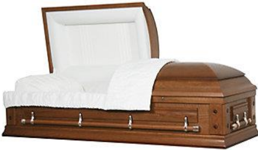
The Remembrance Line $4,315.00

Premium Cremation Casket (Engineered Wood)