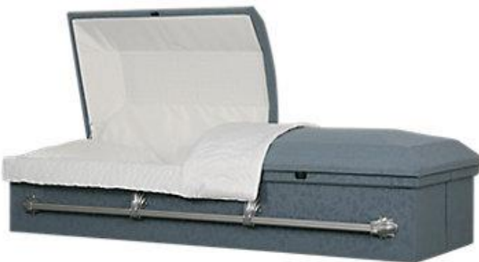
Cloth Covered Viewer $3,970.00

Our Select Rental Caskets (Choose From 7 Styles)