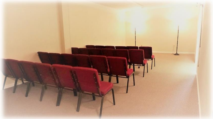
Our Funeral Home Chapel