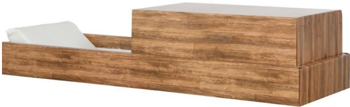
Alternative Container Suitable For Private viewing (Included In The Private Farewell Package)

Memorial Items, Cash advance items and cemetery charges are additional