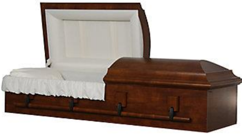
The Hayward Casket $4,615.00

Premium Cremation Casket (Engineered Wood)