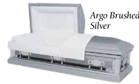
Argo Brushed Silver

Premium Premium Funeral Plan – you may use any of these caskets