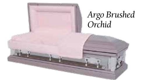
Argo Brushed Orchid

Military Military Funeral Plan – you may use either of these caskets