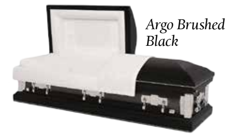
Argo Brushed Black