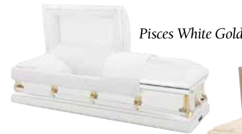
Pisces White Gold

Standard Standard Funeral Plan – you may use any of these caskets