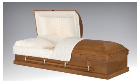
Ashford - Poplar Veneer Satin Medium Walnut Finish Rosetone Crepe Interior - $2,395