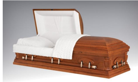
Sovereign - Pecan Satin Finish, Ivory Majestic Velvet - $4,195