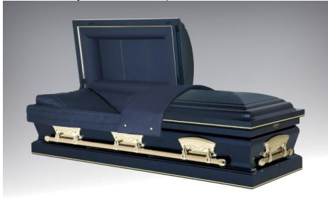
Patriot-18ga Steel – Ebony Finish Freedom-18ga. Steel -Ebony Finish Blue/Black velvet Interior - $3,195