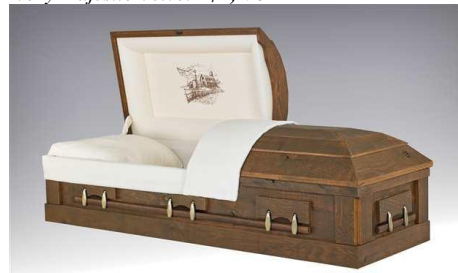
American Barnwood - Oak Satin Timber Finish, Natural Cotton Interior - $3,695