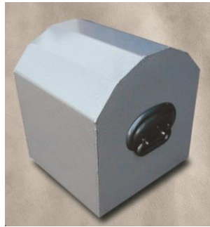
Wise 12 gauge Urn Vault - $425