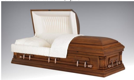
Provincial - Poplar Polished Walnut Finish Rosetone Crepe Interior - $3,795