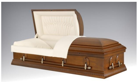
Harris - Poplar Satin Warm Brown Finish, Bamboo Weave Interior - $2,995