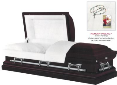
Pierce - 18ga. Steel Cabernet Finish, Tailored Ivory Interior - $2,995