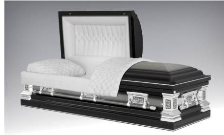
Onyx - Stainless Steel Brushed Natural / Ebony Finish Silver Velvet Interior - $4,295