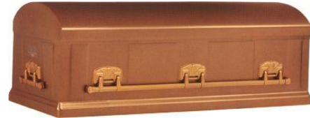
12 gauge steel Clark standard vault - $1,695 Coppertone, silvertone, or white