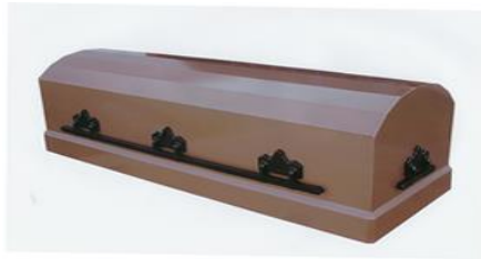
Wise 12 gauge steel Maintenance vault - $1,295

This steel grave liner supports the weight of the surrounding soil and protects the casket. It does not seal. This meets the minimum grave container requirements for both Waco Memorial Park and Chapel Hill Cemetery, both located on Interstate 35 in Waco.