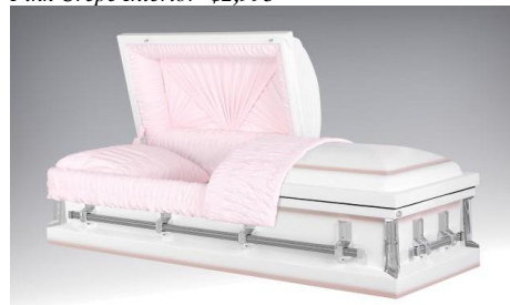
Mercury - 20ga Steel; Many colors available White/Pink Finish Pink Crepe Interior - $2,595