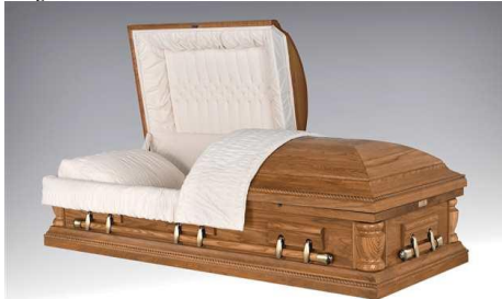
Ratlin - Oak Satin Fawn Finish Almond Velvet Interior - $4,595