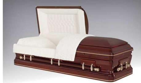
Senator - Cherry High Polished Cherrytone Finish, Almond Velvet Interior - $6,595