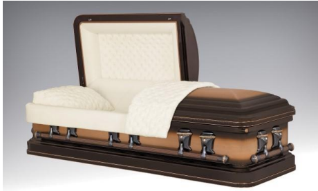
Masterpiece - 16ga Steel Brushed Copper / Metallic Bronze Finish Arbutus Crepe Interior - $5,195