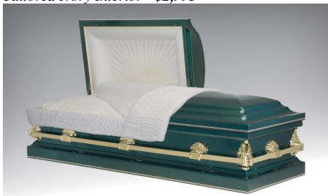
Hunter – 18ga Steel Hunter Green finish with gold trim Rosetone Crepe Interior - $2,895