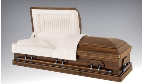
Diplomat - Walnut Polished Natural Walnut Finish, Beige Velvet Interior - $6,995

About Our Wood Caskets... compares to the rich, warm glow of well-crafted hardwood. From the elegance of solid hardwood to the simplicity of hardwood veneer, this assortment from Grace Gardens Funeral Home shows a variety of woods and finishes that cater to all tastes and prices.