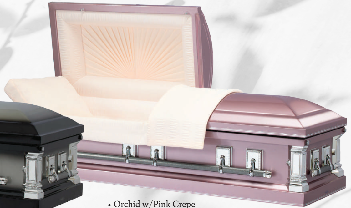
• Orchid w/Pink Crepe