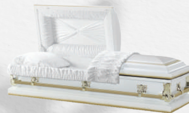
•White shaded Gold White Crepe