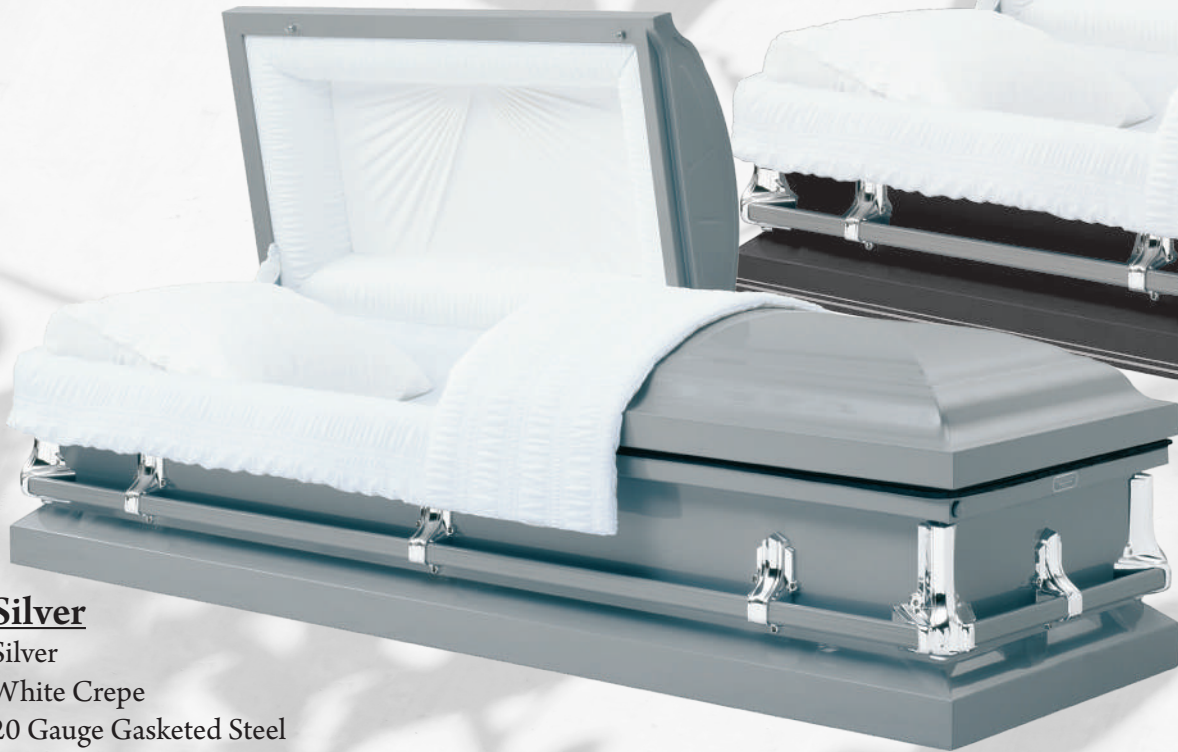
Silver Silver White Crepe 20 Gauge Gasketed Steel