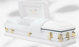
• White w/ White Crepe