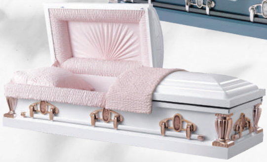
• White Pink Crepe