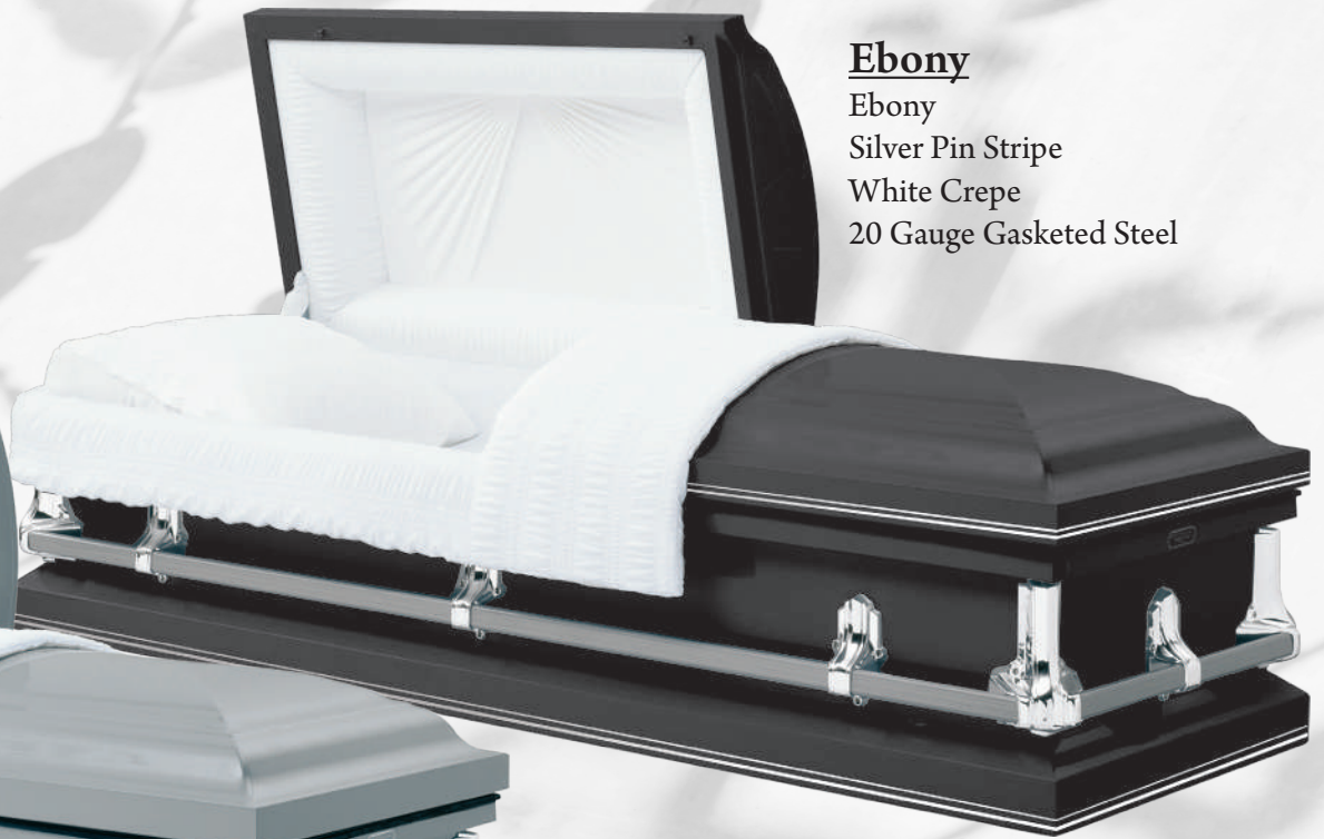
Ebony Ebony Silver Pin Stripe White Crepe 20 Gauge Gasketed Steel