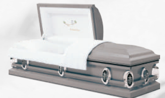
• Silver w/ White Crepe