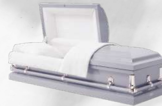
• Silver w/ White Crepe