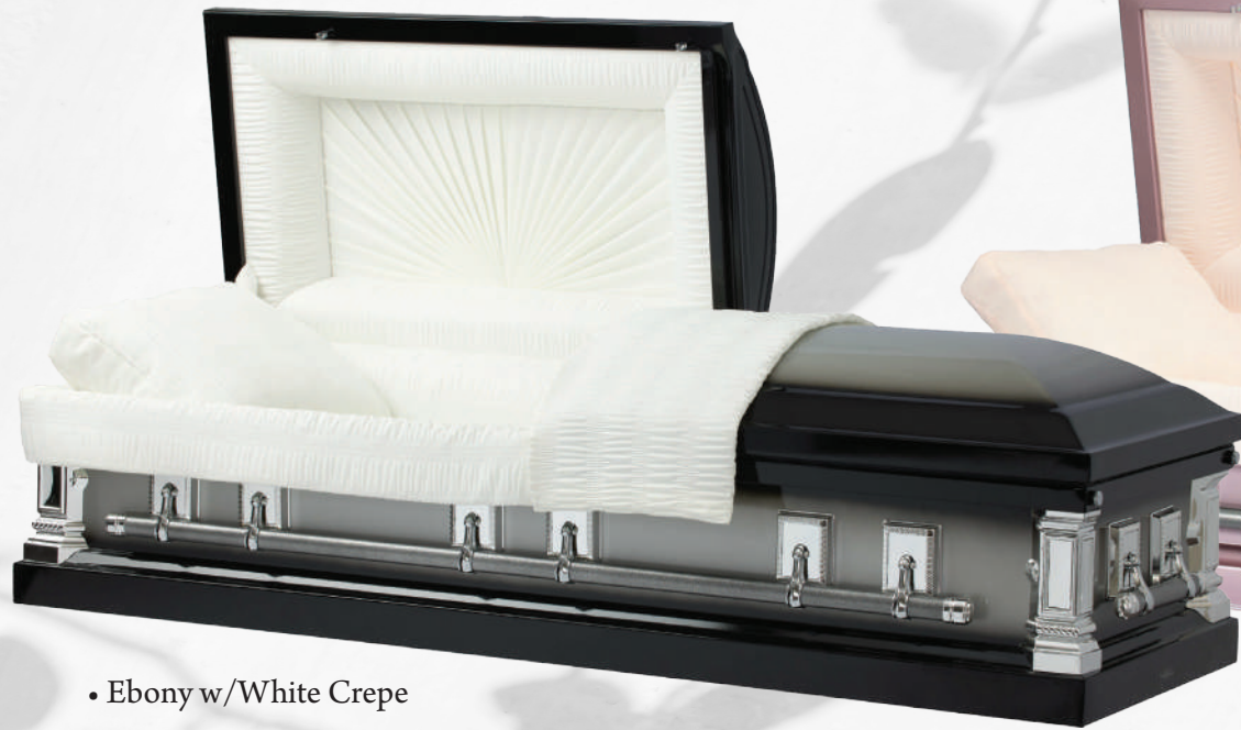
• Ebony w/White Crepe