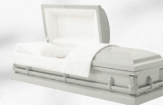
• Silver w/ White Crepe