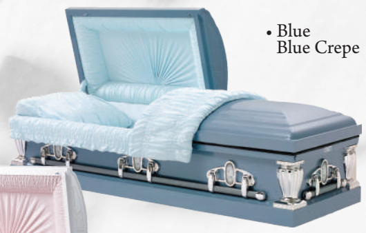
• Blue Blue Crepe