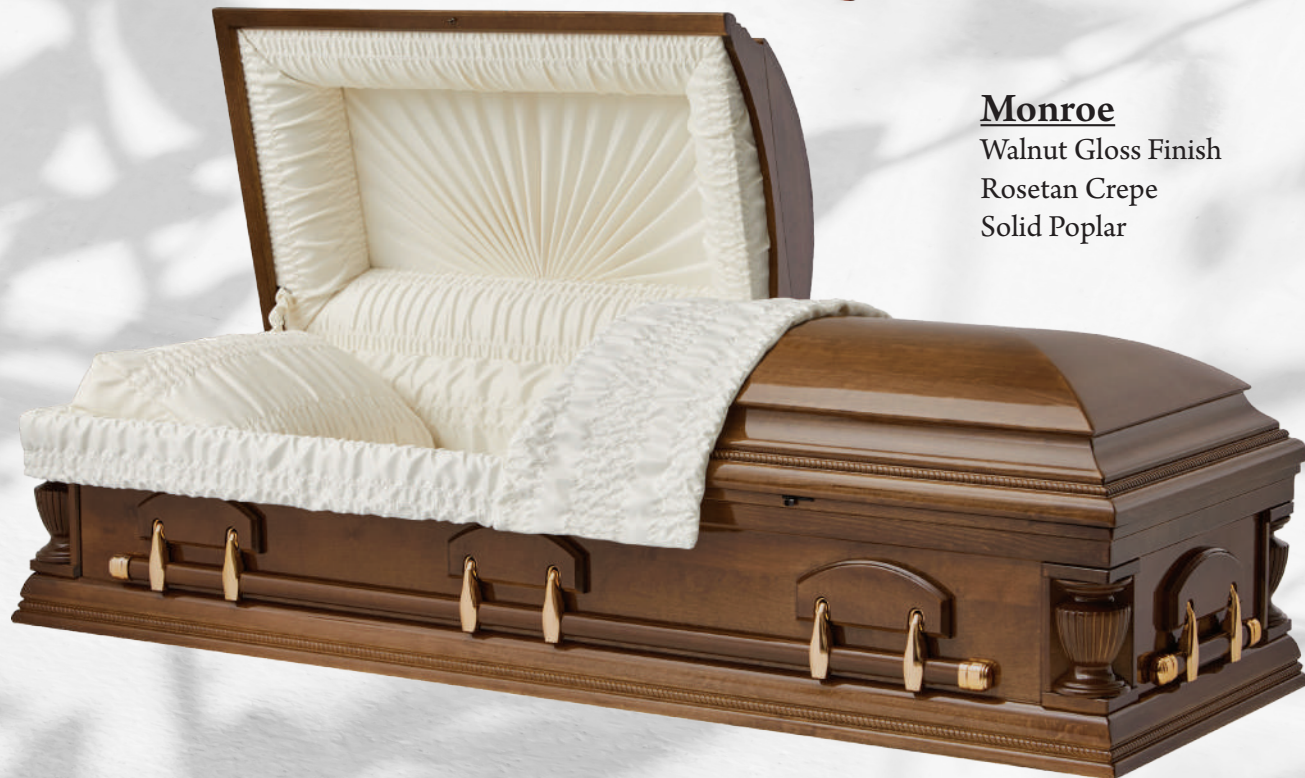
Monroe Walnut Gloss Finish Rosetan Crepe Solid Poplar