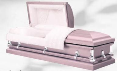
•Orchid Pink Crepe