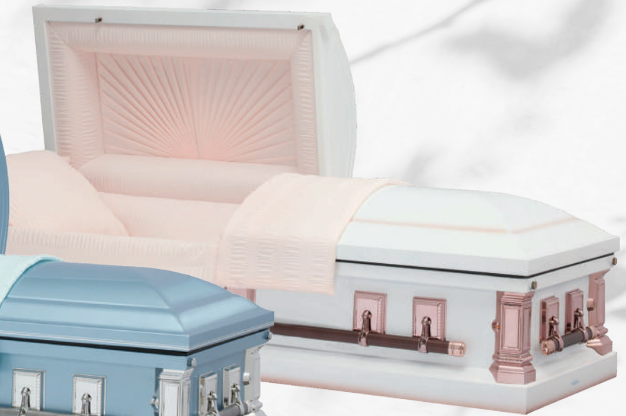
• White w/Pink Crepe