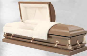
•Copper Rosetan Crepe