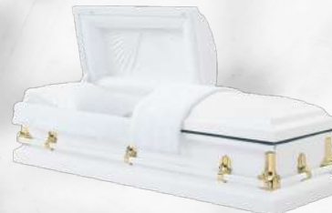
•White White Crepe