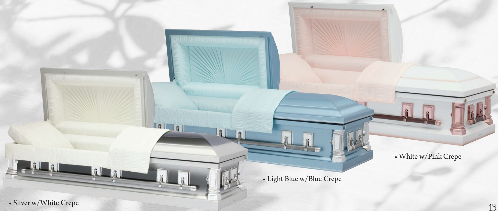
• Silver w/White Crepe