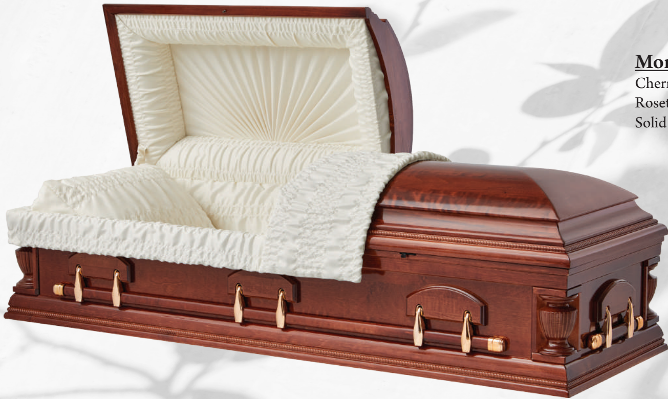
Monroe Cherry Gloss Finish Rosetan Crepe Solid Poplar