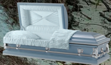
•Blue shaded Silver Blue Crepe