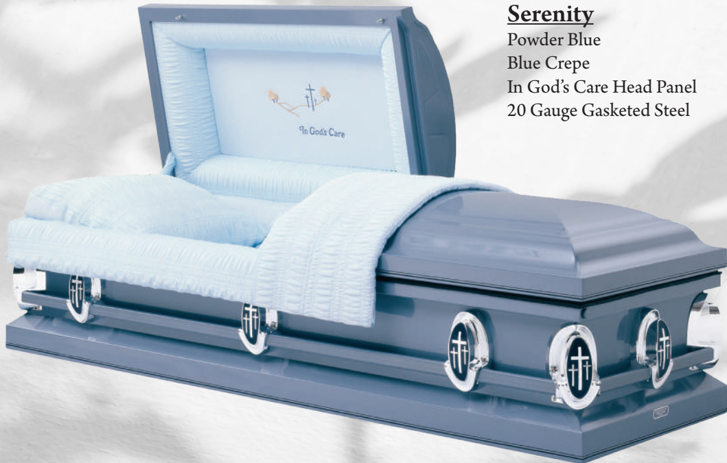
Serenity Powder Blue Blue Crepe In God's Care Head Panel 20 Gauge Gasketed Steel