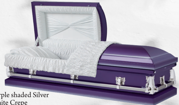
•Purple shaded Silver White Crepe