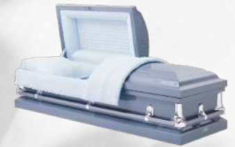
• Blue w/ Blue Crepe