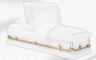
• White w/ White Crepe