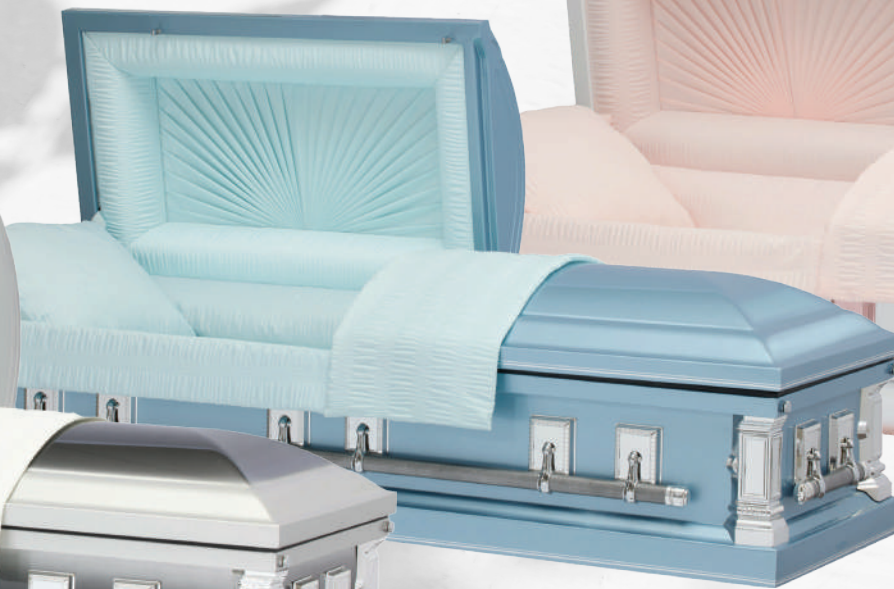
• Light Blue w/Blue Crepe