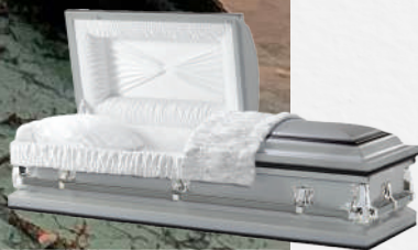
•Silver shaded Ebony White Crepe