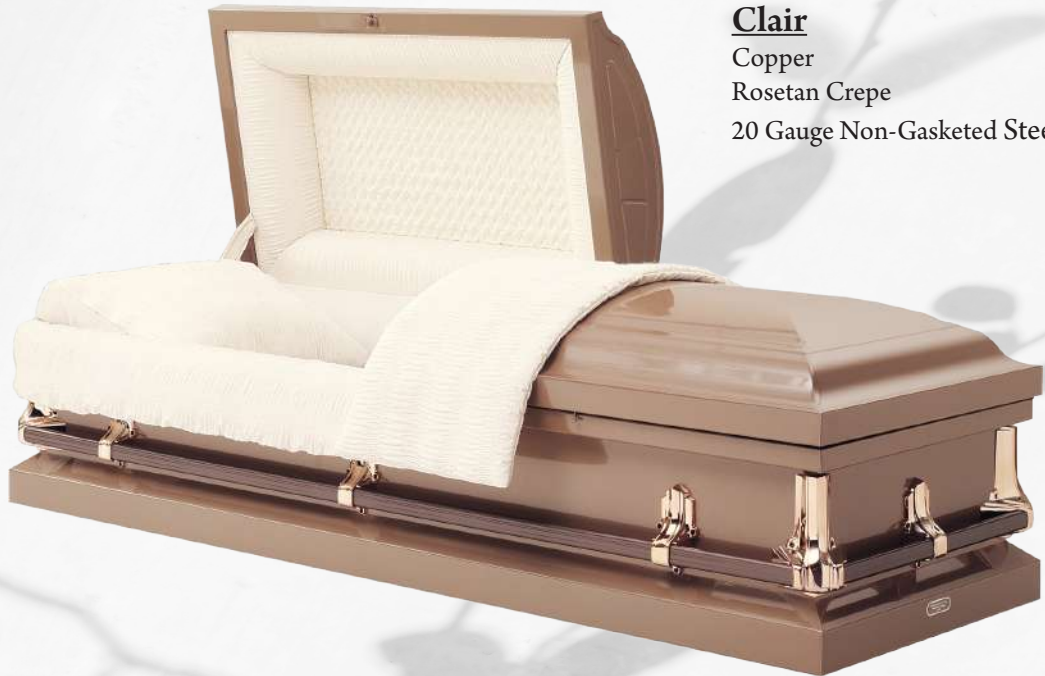
Clair Copper Rosetan Crepe 20 Gauge Non-Gasketed Steel