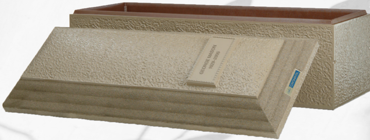
Continental Included in Traditional Burial Package ($1,800 Vault Only)