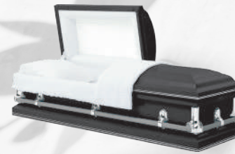
• Ebony w/ White Crepe