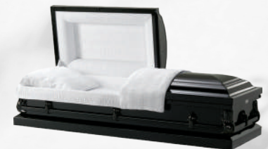
• Ebony w/ White Crepe