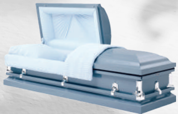
•Blue Blue Crepe