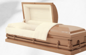
• Copper w/ Rosetan Crepe