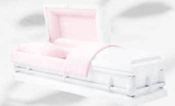
• White w/ Pink Crepe (Also available with White Crepe)