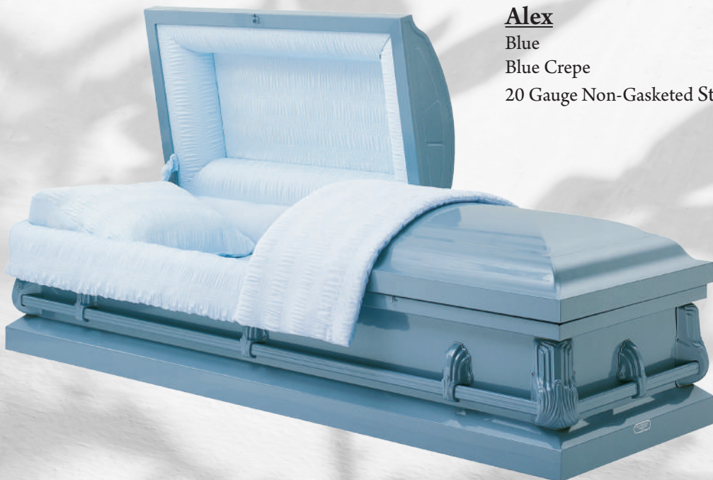
Alex Blue Blue Crepe 20 Gauge Non-Gasketed Steel