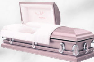
• Orchid w/ Pink Crepe