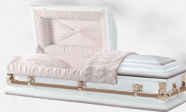
•White shaded Orchid Pink Crepe