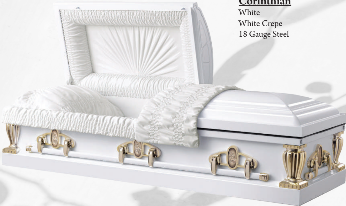
Corinthian White White Crepe 18 Gauge Steel