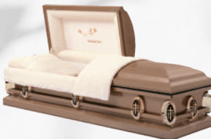
• Copper w/ Rosetan Crepe