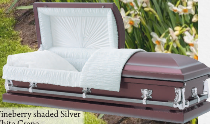
•Wineberry shaded Silver White Crepe