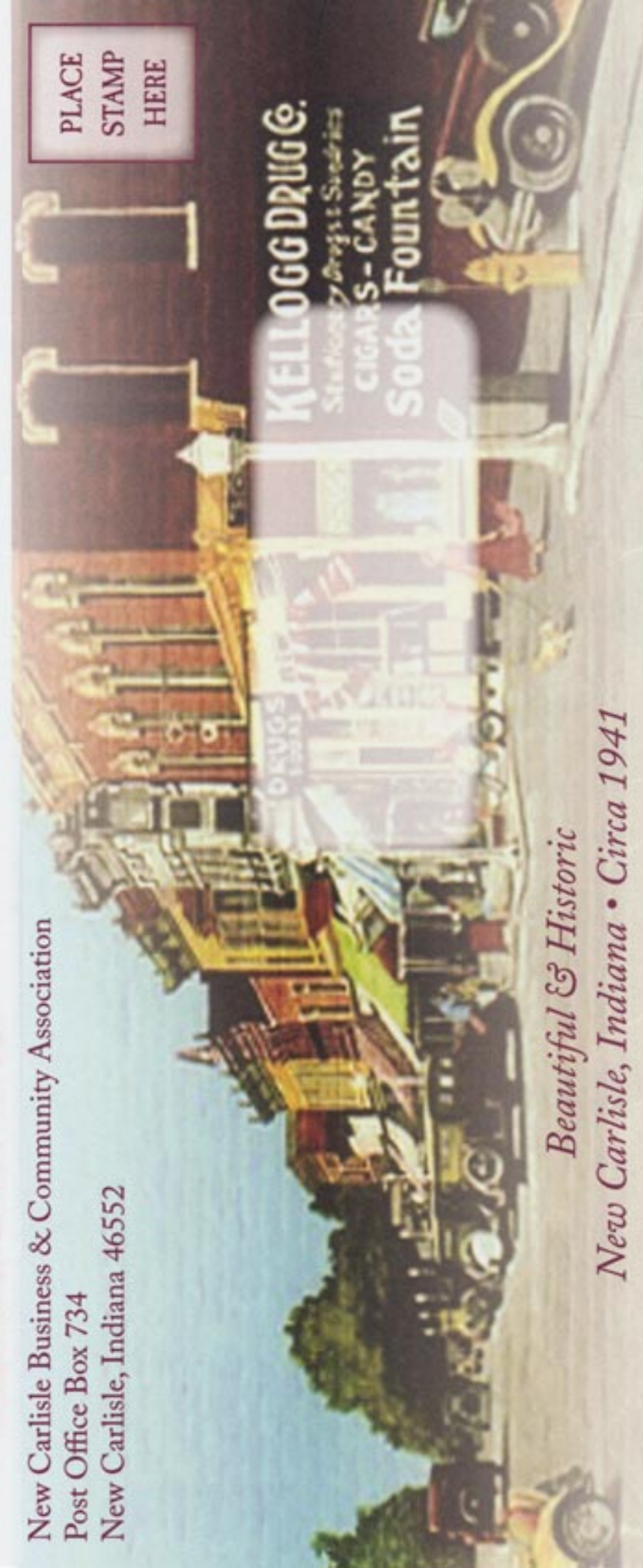
Beautiful & Historic New Carlisle, Indiana • Circa 1941