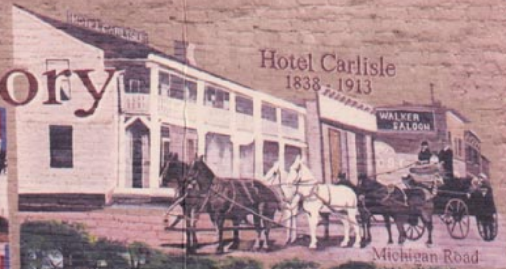
Hotel Carlisle 1838 - 1913