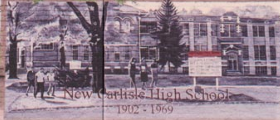
New Carlisle High School 1902 - 1969