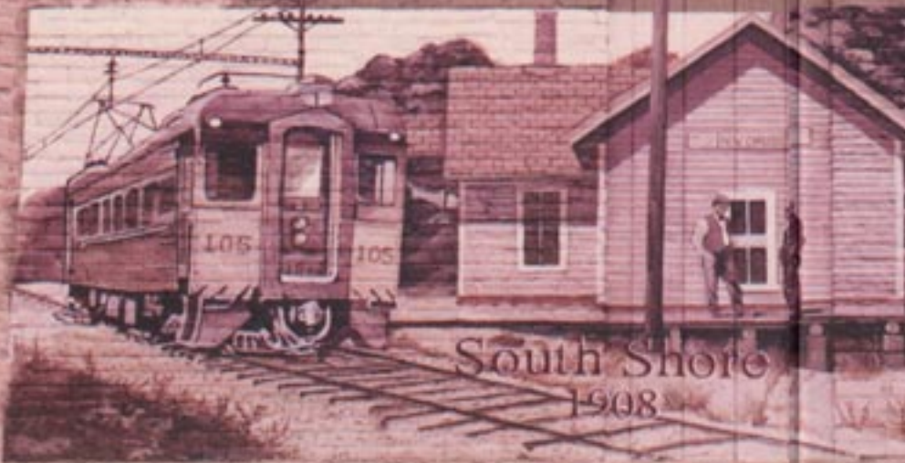
South Shore 1908