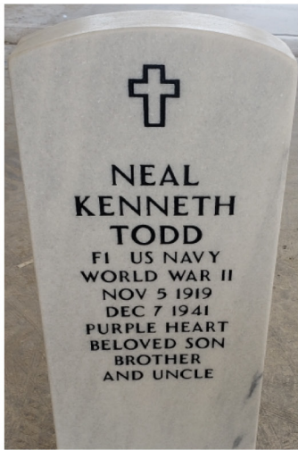
UPRIGHT HEADSTONE WHITE MARBLE (U) OR LIGHT GRAY GRANITE (V)

This headstone is 42 inches long, 13 inches wide and 4 inches thick. Weight is approximately 230 pounds. Variations may occur in stone color, and the marble may contain light to moderate veining. Additional inscription is limited to 15 characters (including spaces) up to four lines maximum.