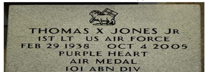
SMALL FLAT GRANITE (L)

This grave marker is 18 inches long, 12 inches wide, and 3 inches thick. Weight is approximately 70 pounds. Variations may occur in stone color. Additional inscription is limited to 27 characters (including spaces) up to two lines maximum.