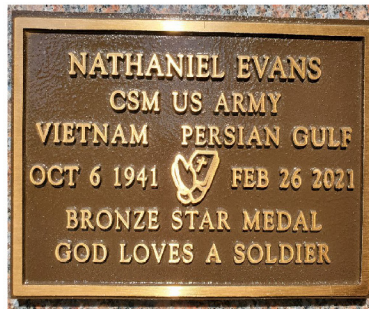
BRONZE NICHE (Z)

This niche marker is 8-1/2 inches long, 5-1/2 inches wide, with 7/16 inch rise. Weight is approximately 3 pounds; mounting bolts and washers are furnished with the marker. Used for columbarium or mausoleum interment. Also provided to supplement a privately-purchased, permanent and durable headstone or marker for eligible Veterans who died on or after November 1, 1990 and are buried in a private cemetery. Additional inscription is limited to 27 characters (including spaces) up to two lines maximum.