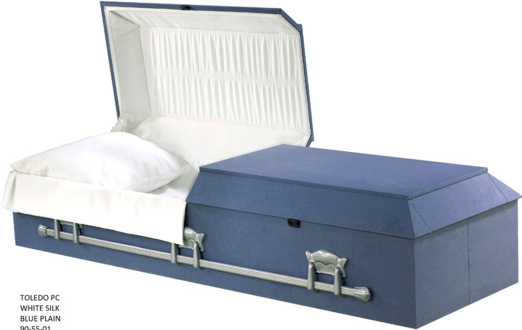
TOLEDO PC WHITE SILK BLUE PLAIN 90-55-01