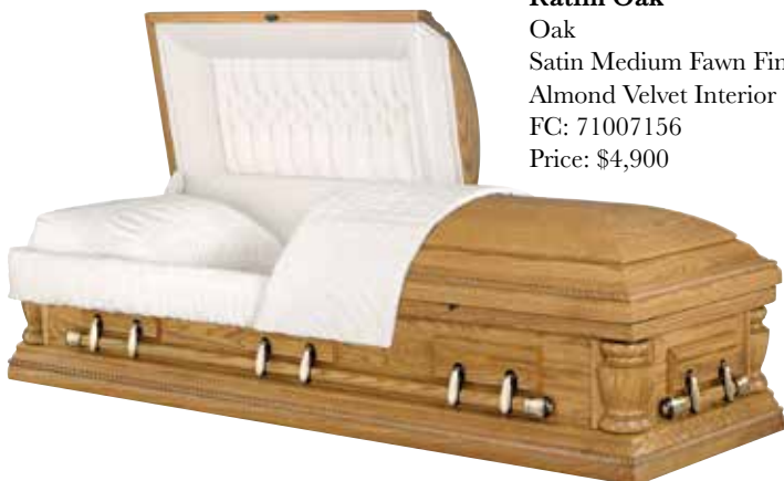
Ratlin Oak Oak Satin Medium Fawn Finish Almond Velvet Interior FC: 71007156 Price: $4,900