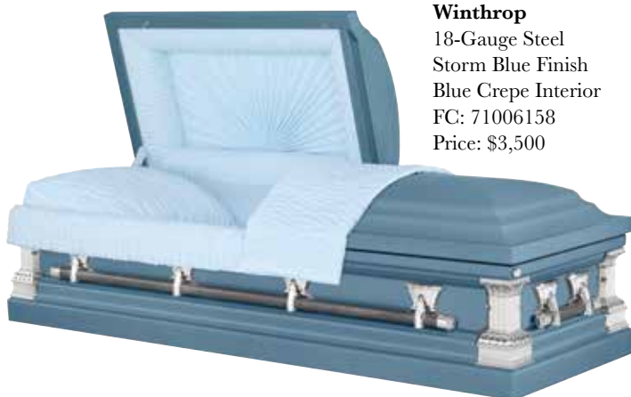
Winthrop 18-Gauge Steel Storm Blue Finish Blue Crepe Interior FC: 71006158 Price: $3,500