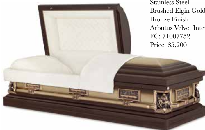
Pieta Stainless Steel Brushed Elgin Gold / Metallic Bronze Finish Arbutus Velvet Interior FC: 71007752 Price: $5,200