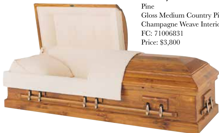
Country Pine Pine Gloss Medium Country Pine Finish Champagne Weave Interior FC: 71006831 Price: $3,800