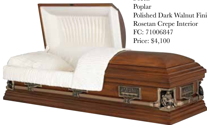
Pieta Poplar Polished Dark Walnut Finish Rosetan Crepe Interior FC: 71006847 Price: $4,100