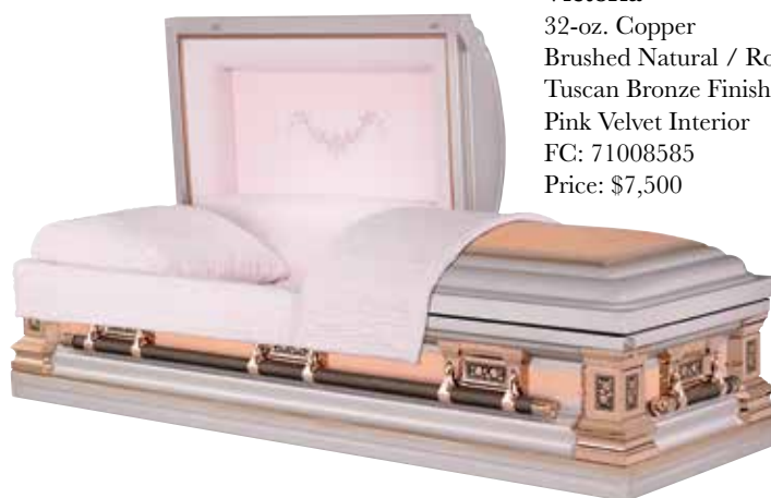
Victoria 32-oz. Copper Brushed Natural / Rosebud / Tuscan Bronze Finish Pink Velvet Interior FC: 71008585 Price: $7,500