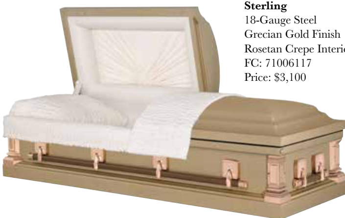
Sterling 18-Gauge Steel Grecian Gold Finish Rosetan Crepe Interior FC: 71006117 Price: $3,100