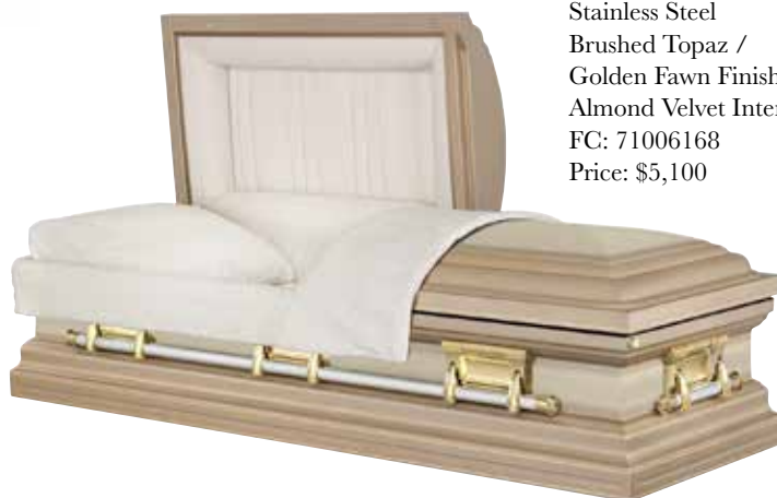
Newport Stainless Steel Brushed Topaz / Golden Fawn Finish Almond Velvet Interior FC: 71006168 Price: $5,100