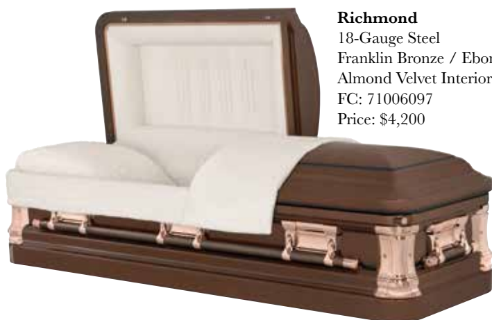
Richmond 18-Gauge Steel Franklin Bronze / Ebony Finish Almond Velvet Interior FC: 71006097 Price: $4,200