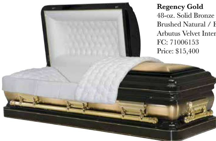
Regency Gold 48-oz. Solid Bronze Brushed Natural / Ebony Finish Arbutus Velvet Interior FC: 71006153 Price: $15,400