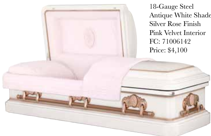
Cameo Rose 18-Gauge Steel Antique White Shaded Silver Rose Finish Pink Velvet Interior FC: 71006142 Price: $4,100