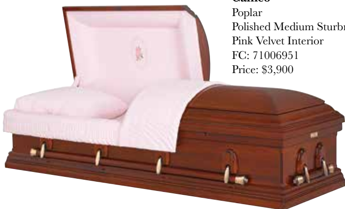
Cameo Poplar Polished Medium Sturbridge Finish Pink Velvet Interior FC: 71006951 Price: $3,900