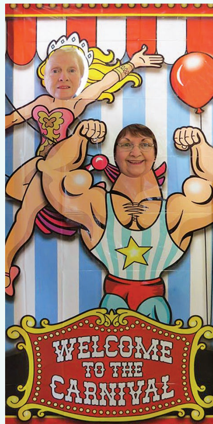
Seniors enjoying themselves at the 2015 Winter Carnival.

The Ludlow Senior Center is located on the ground floor of 37 Chestnut Street in