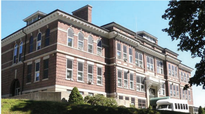
The Ludlow Senior Center