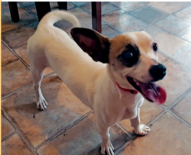
Frodo, happy to be in his new forever home!