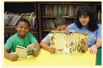
SBGC members receive help with their homework after school.

Great Futures Start at the Springfield Boys and Girls Club And You Can Help!