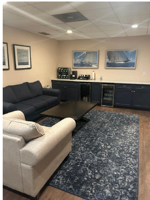
Our new coffee lounge in West Sayville