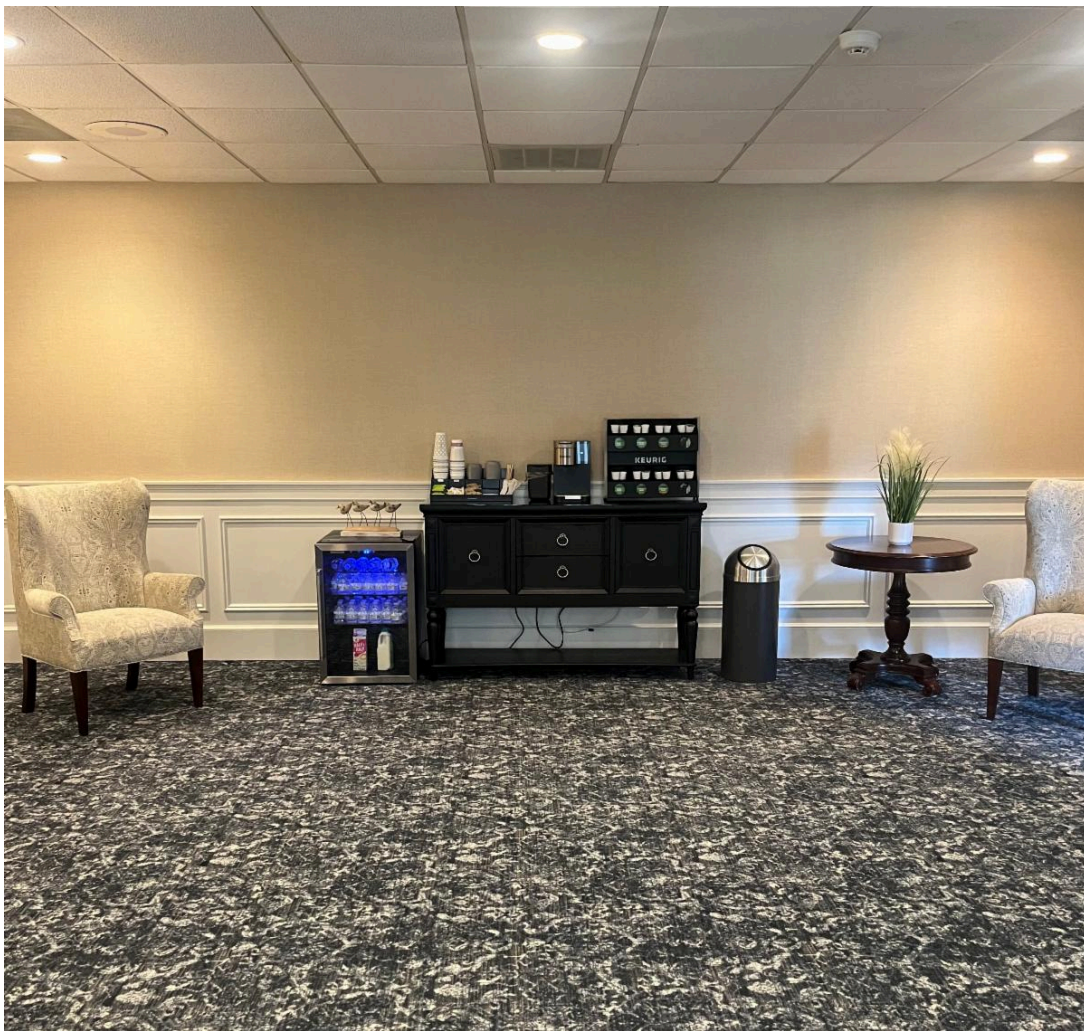
Our new coffee lounge in Bayport

Raynor & D'Andrea Funeral Homes recently remodeled its facilities to include a new coffee and refreshment area. We invite you to help yourself to a beverage and a moment of respite