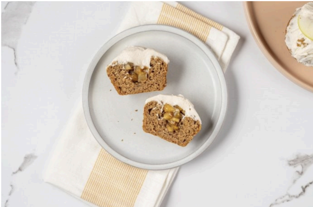
Danielle Moore for Taste of Home Overhead landscape shot of Taste of Home's Apple Pie Cupcakes