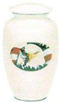
EAGLE FLAG VASE