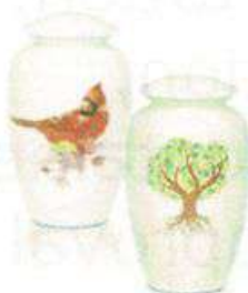
WILD LIFE VASE