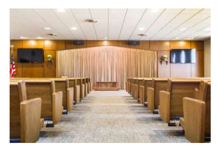
Chapel A Seats Approximately 150