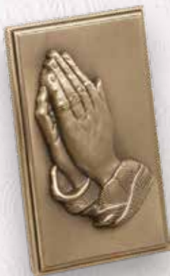
VC-7 Praying Hands