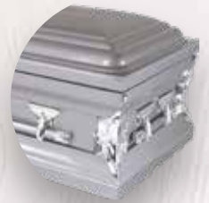
B-130 Cadillac Gray Gray Crepe