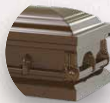
SS-41M Bronze Rosetan Crepe