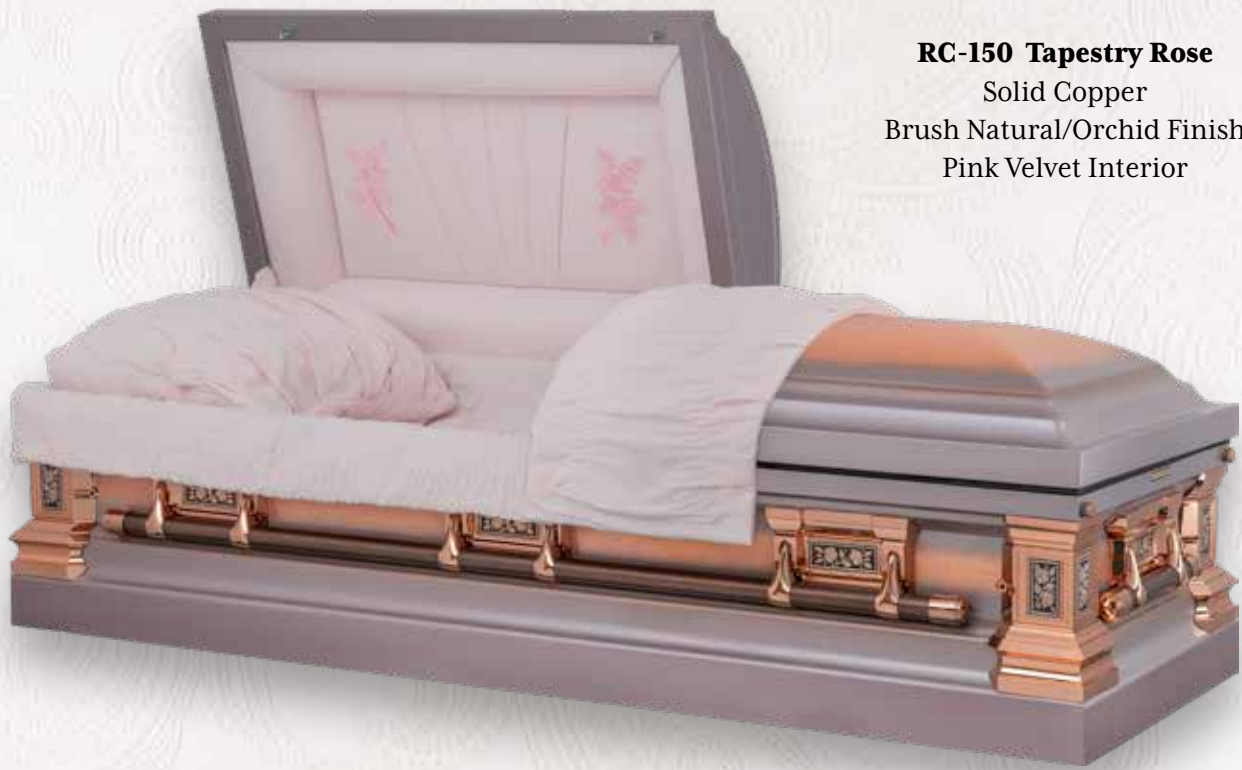
RC-150 Tapestry Rose Solid Copper Brush Natural/Orchid Finish Pink Velvet Interior