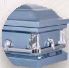
TC-3 Powder Blue Blue Crepe