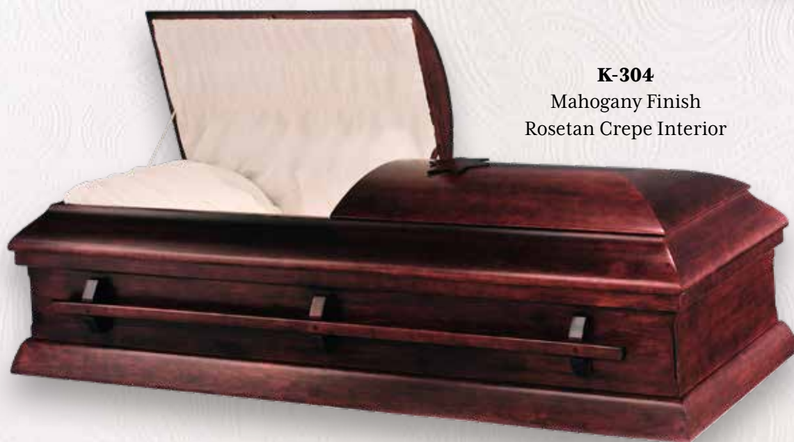
K-304 Mahogany Finish Rosetan Crepe Interior