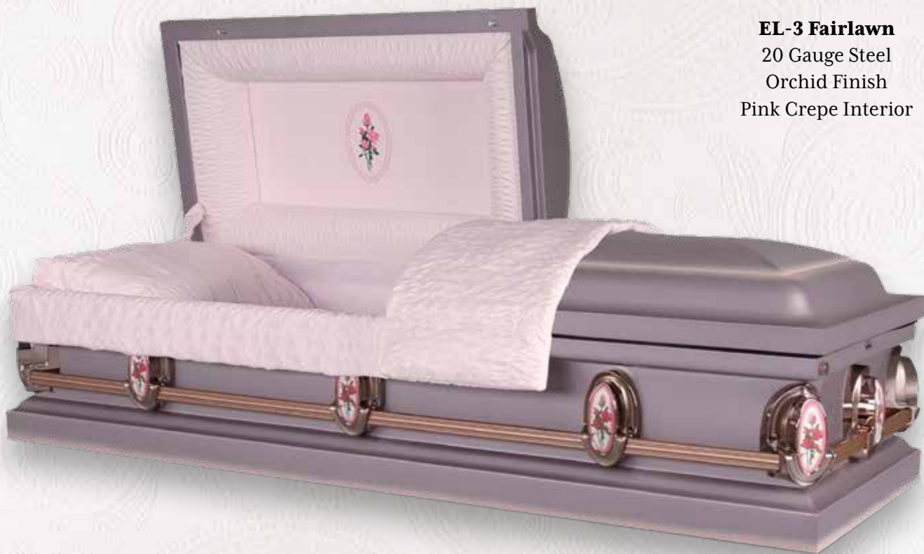
EL-3 Fairlawn 20 Gauge Steel Orchid Finish Pink Crepe Interior