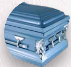
B-110 Monarch Blue Blue Crepe