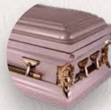
B-120 Moss Rose Rosetan Crepe