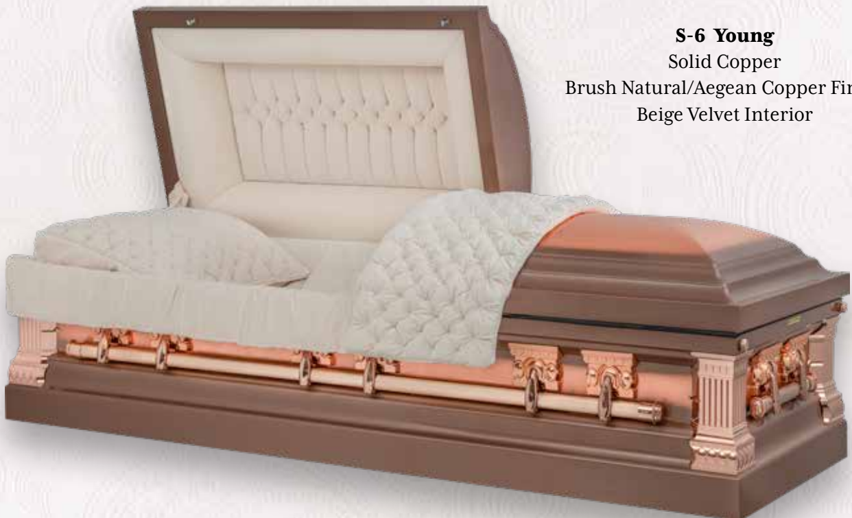
S-6 Young Solid Copper Brush Natural/Aegean Copper Finish Beige Velvet Interior