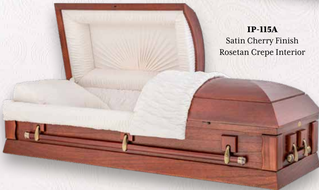
IP-115A Satin Cherry Finish Rosetan Crepe Interior