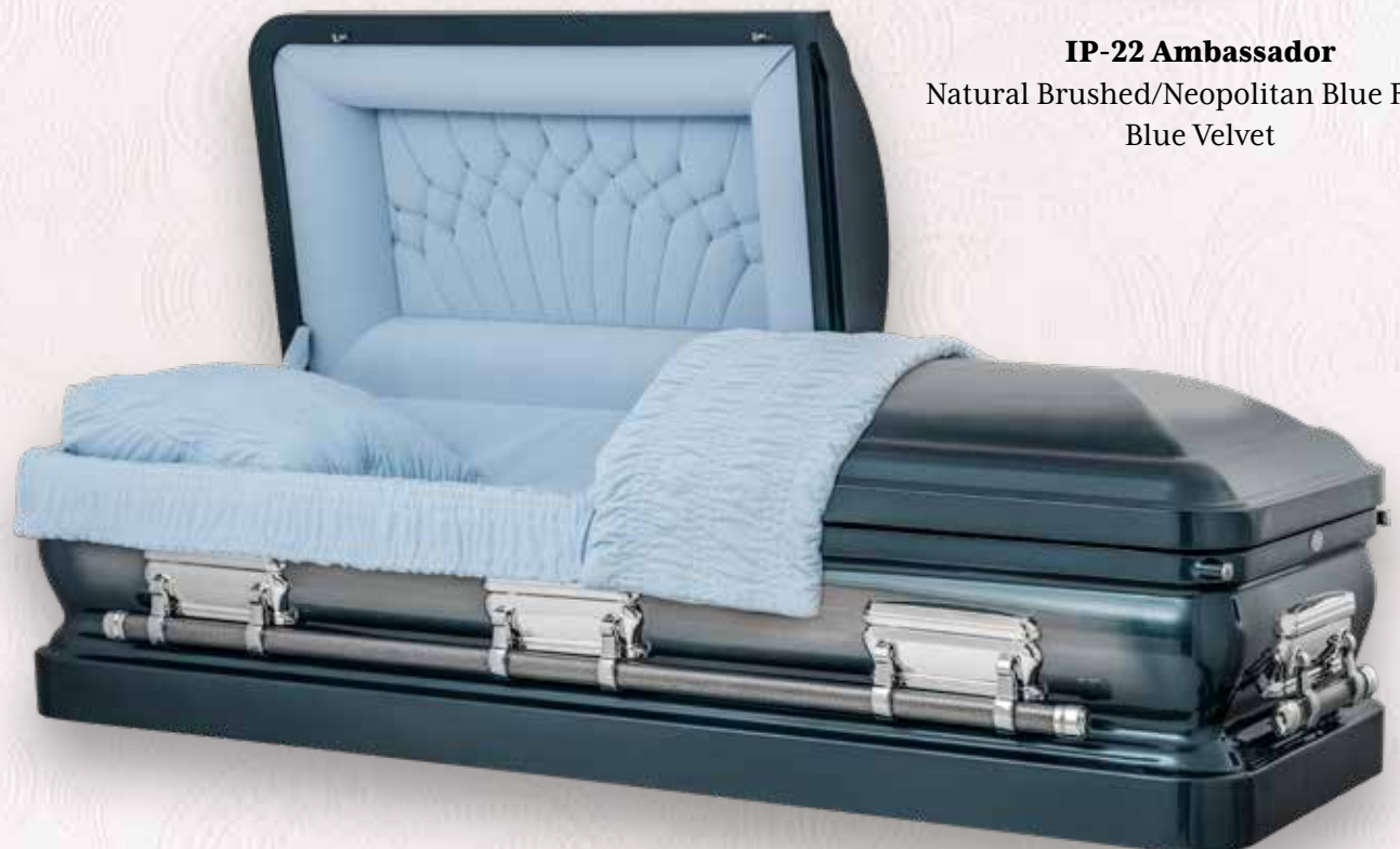
IP-22 Ambassador Natural Brushed/Neopolitan Blue Finish Blue Velvet