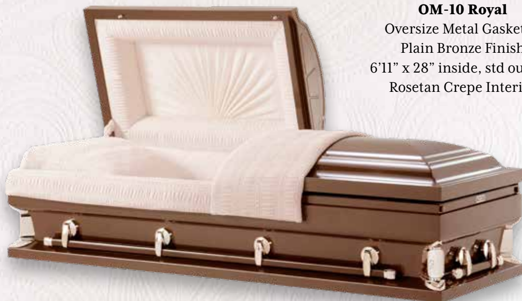
OM-10 Royal Oversize Metal Gasketed Plain Bronze Finish 6'11" x 28" inside, std outside Rosetan Crepe Interior