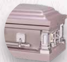
MC-21 Silver / Light Orchid Pink Velvet