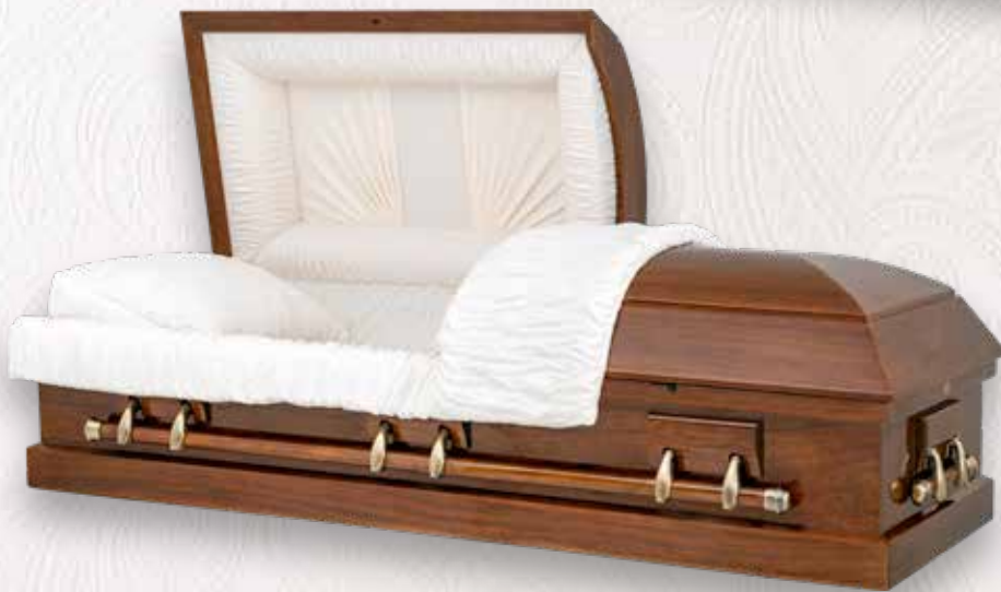
AC-26 Denton Select Hardwood Satin Mahogany Finish Rosetan Crepe Interior