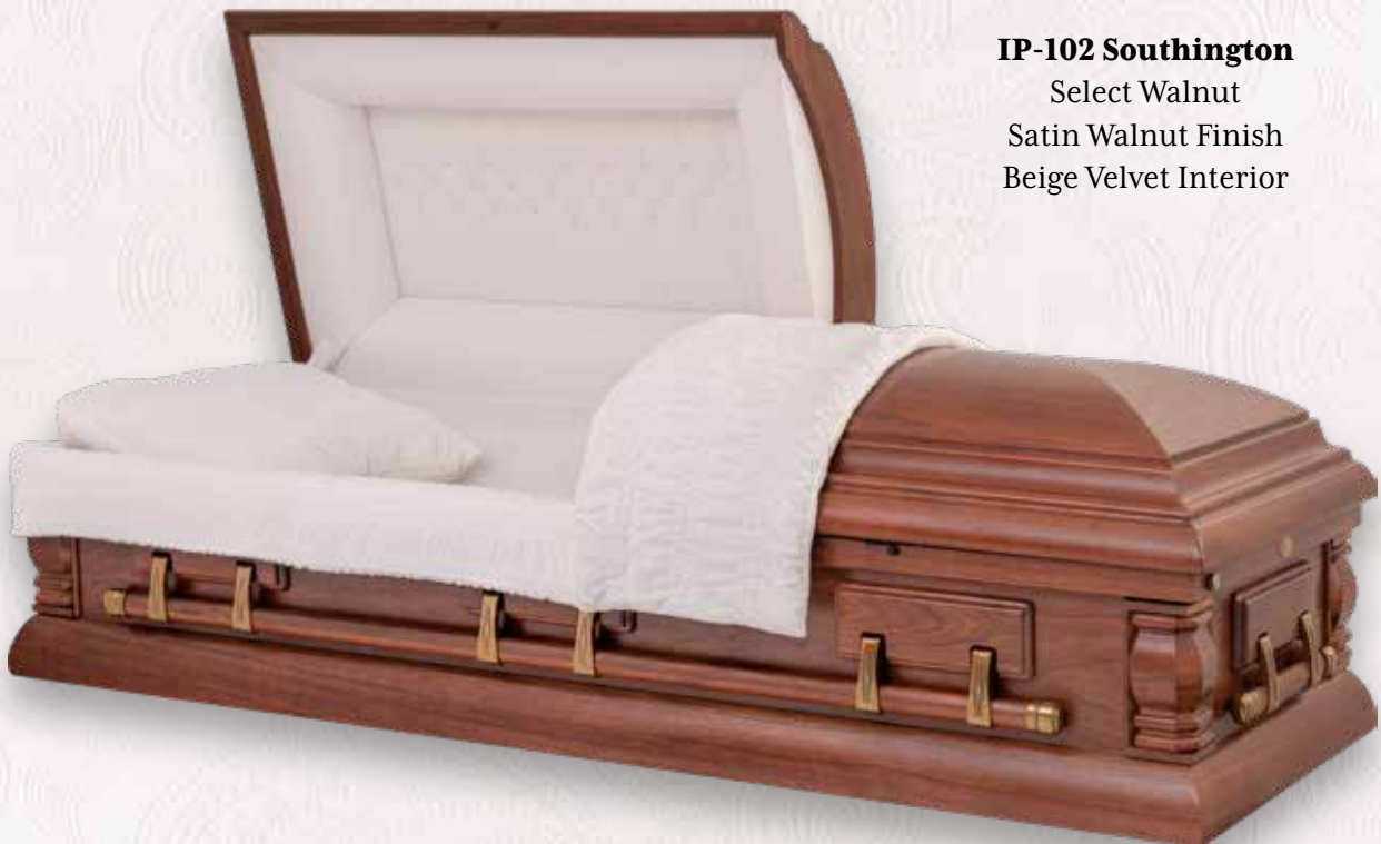
IP-102 Southington Select Walnut Satin Walnut Finish Beige Velvet Interior