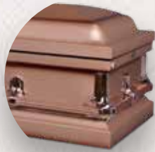
MC-63 Copper / Bronze Rosetan Crepe