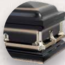
MC-60 Ebony / Gold Ivory Crepe