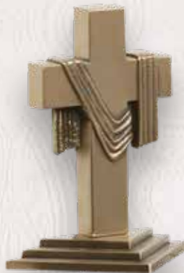
VC-5 Christian Cross