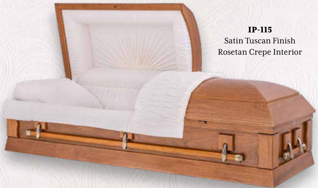
IP-115 Satin Tuscan Finish Rosetan Crepe Interior