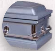
MC-61 Blue / Silver Blue Crepe