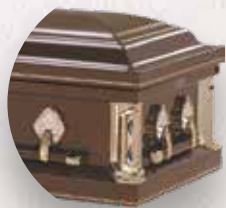
A-10 Bronze Rosetan Crepe