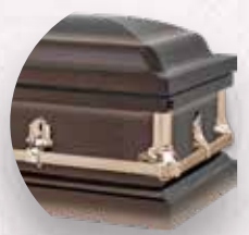
MC-68 Bronze / Copper Rosetan Crepe