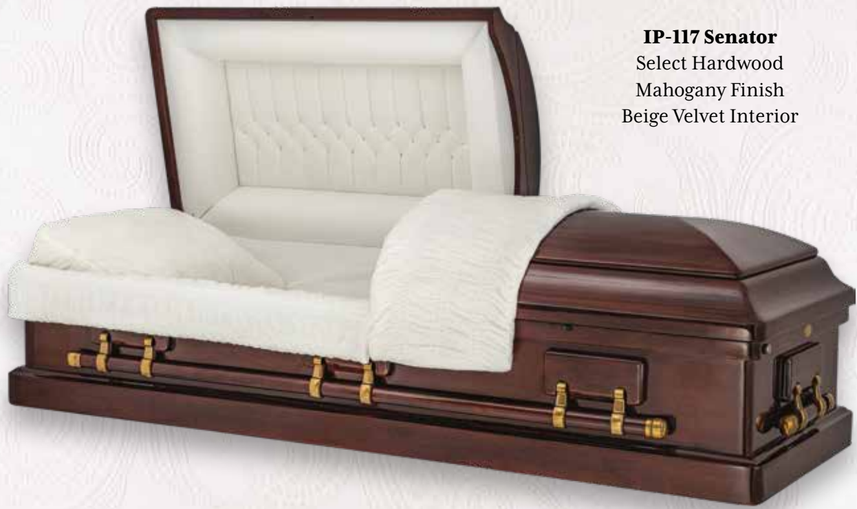
IP-117 Senator Select Hardwood Mahogany Finish Beige Velvet Interior