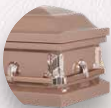
TC-1 Copper Rosetan Crepe