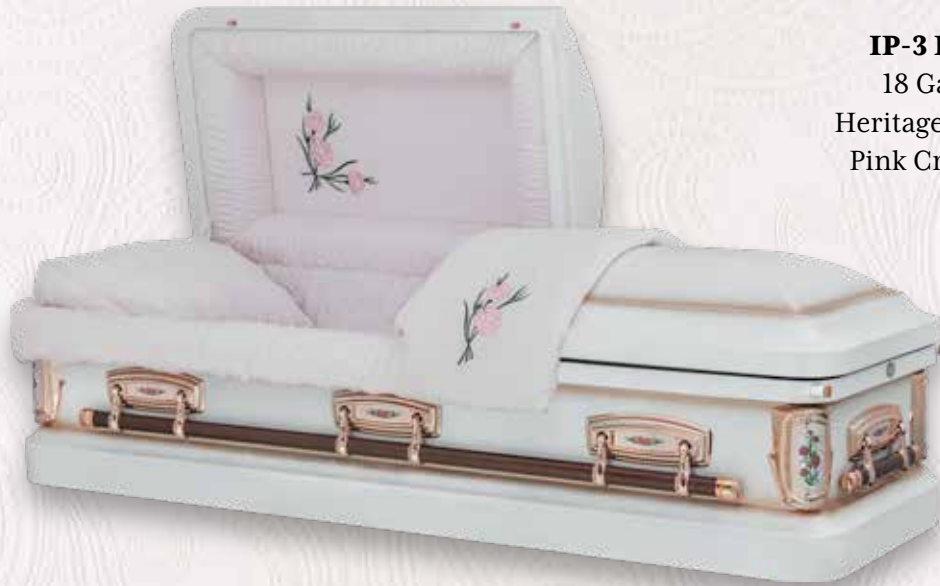
IP-3 Ivory Rose 18 Gauge Steel Heritage White Finish Pink Crepe Interior