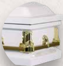
TC-4 White Ivory Crepe