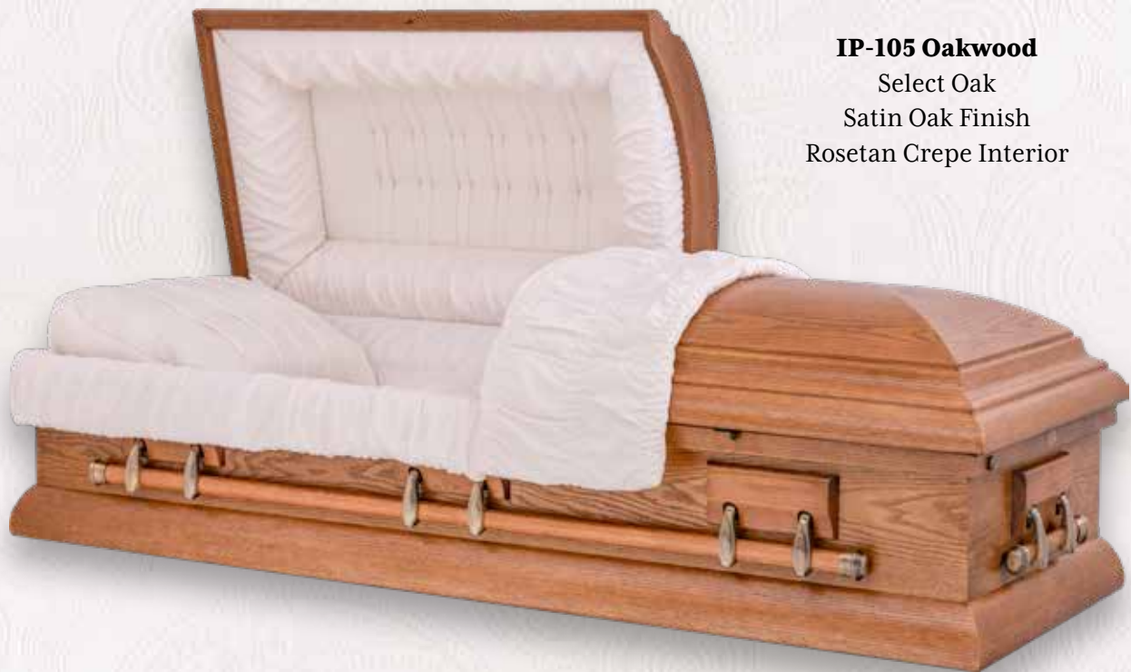
IP-105 Oakwood Select Oak Satin Oak Finish Rosetan Crepe Interior