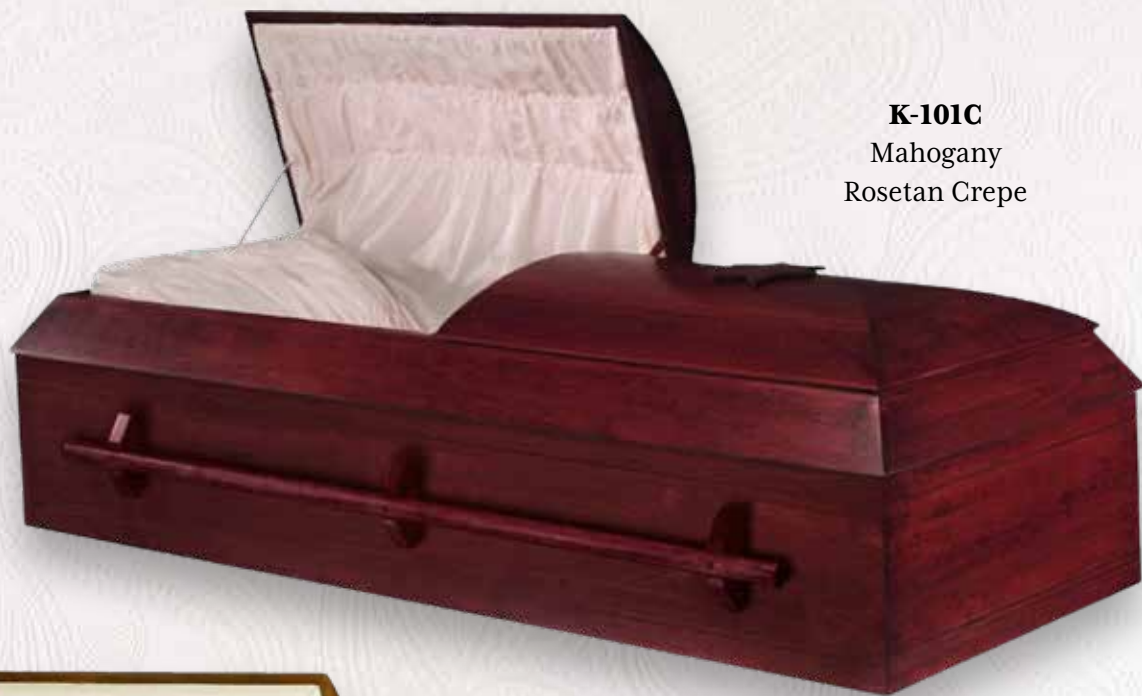
K-101C Mahogany Rosetan Crepe