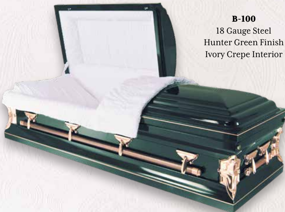
B-100 18 Gauge Steel Hunter Green Finish Ivory Crepe Interior