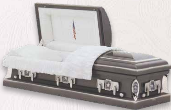
A-40 Patriot 18 Gauge Steel Pewter/Silver Finish Oyster Crepe Interior

18 Gauge Steel Neopolitan Blue Finish Royal Blue Velvet Interior Choice of Panel