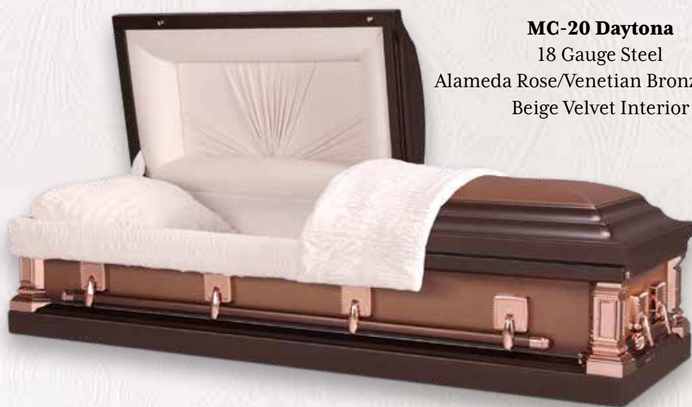
MC-20 Daytona 18 Gauge Steel Alameda Rose/Venetian Bronze Finish Beige Velvet Interior