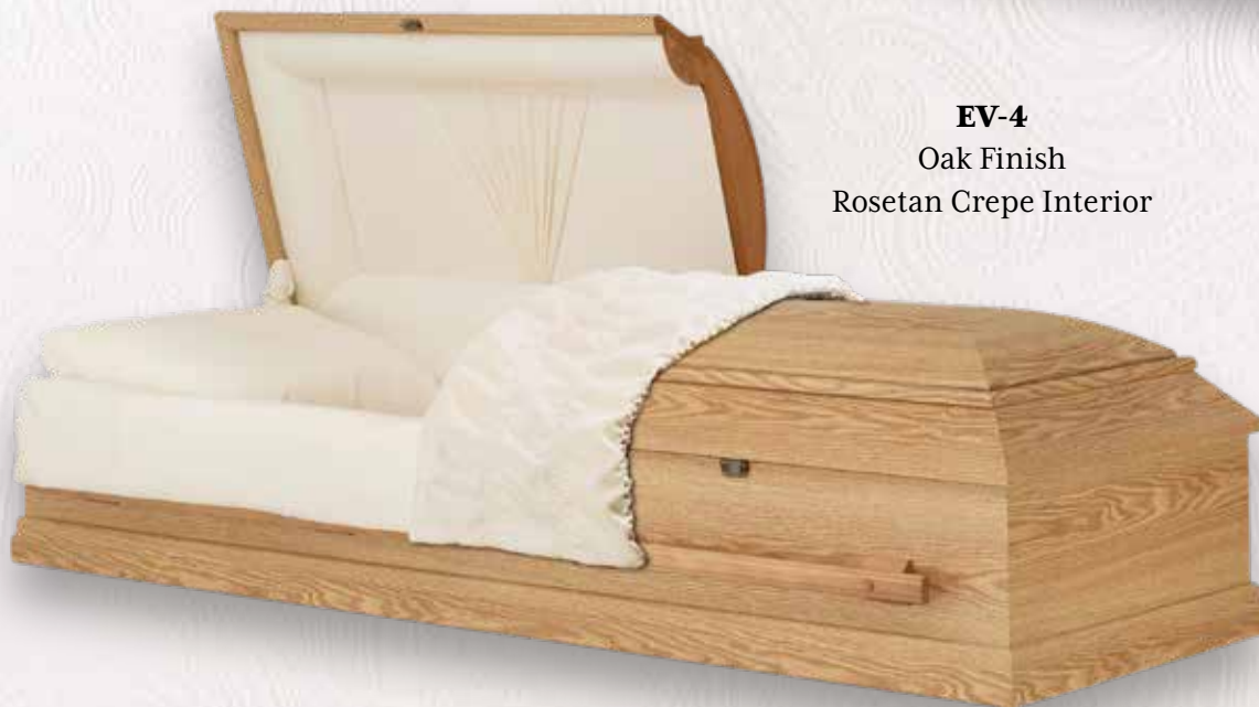
EV-4 Oak Finish Rosetan Crepe Interior