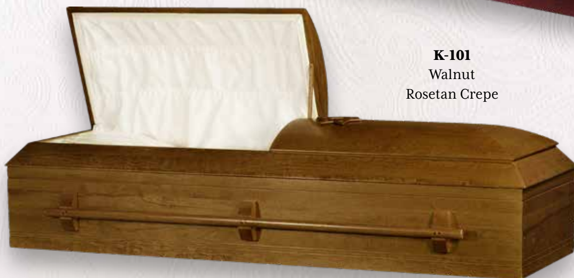
K-101 Walnut Rosetan Crepe