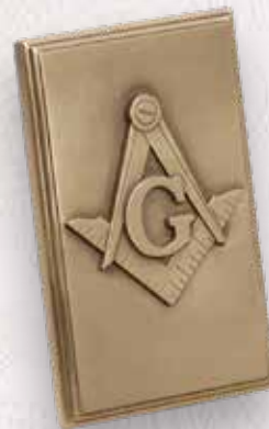
VC-6 Masonic Emblem