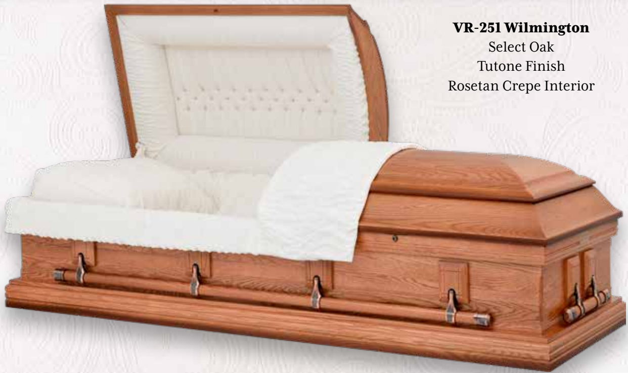
VR-251 Wilmington Select Oak Tutone Finish Rosetan Crepe Interior