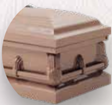
SS-10M Copper Rosetan Crepe