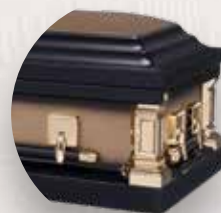
MC-22 Sunset Gold / Ebony Champagne Velvet