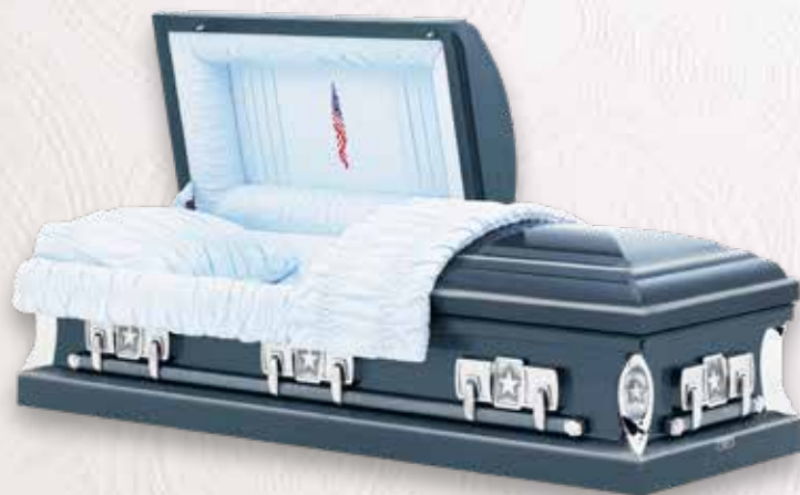
A-40 Patriot 18 Gauge Steel Metallic Blue/Silver Finish Blue Crepe Interior