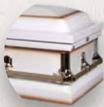
MC-65 White / Gold White Crepe