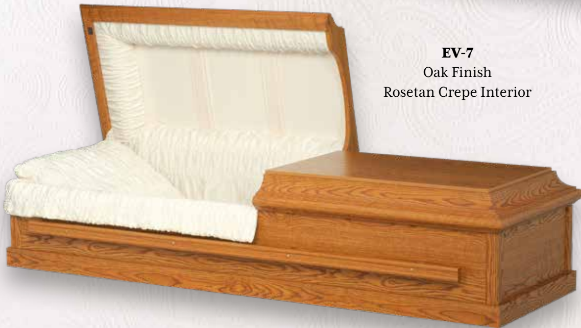
EV-7 Oak Finish Rosetan Crepe Interior