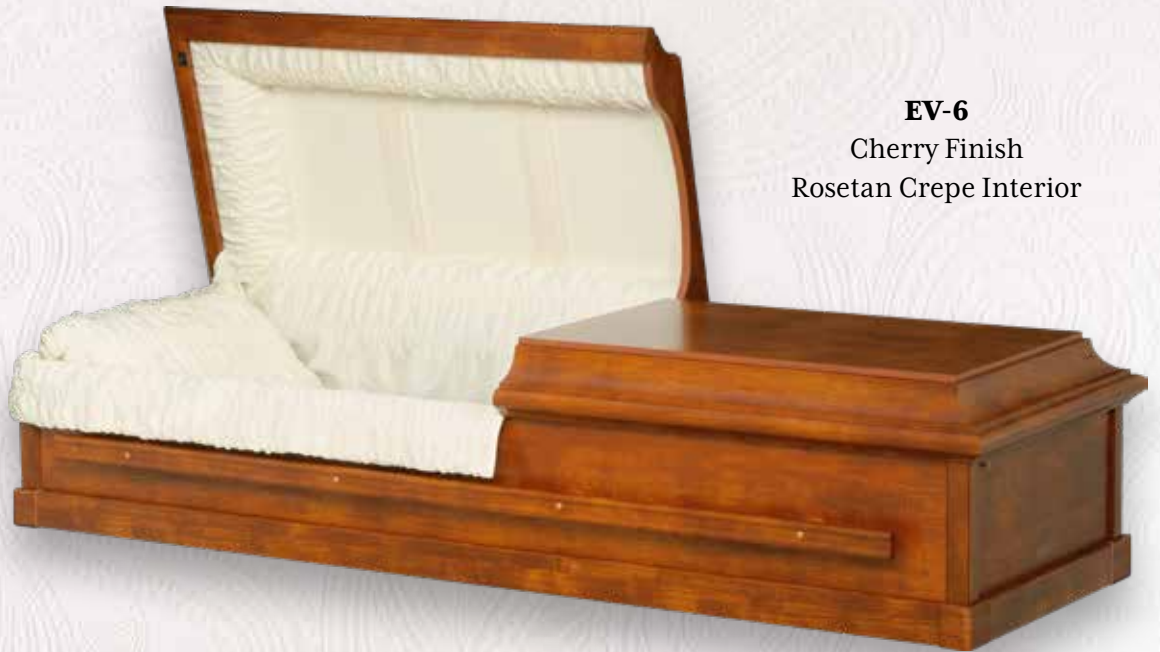
EV-6 Cherry Finish Rosetan Crepe Interior