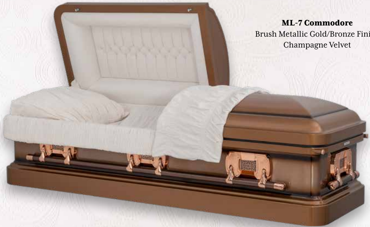
ML-7 Commodore Brush Metallic Gold/Bronze Finish Champagne Velvet