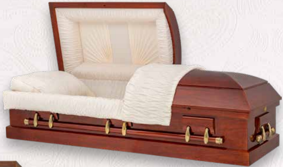
IP-109 Venice Select Hardwood Gloss Walnut Finish Rosetan Crepe Interior