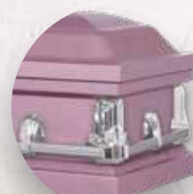
TC-6 Orchid Pink Crepe