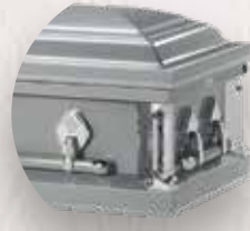
A-13 Silver White Crepe