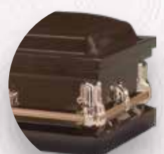
TC-7 Venetian Bronze Rosetan Crepe