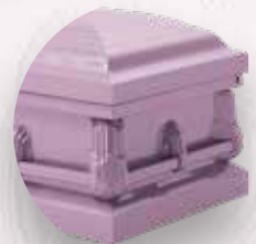
SS-42M Orchid Pink Crepe