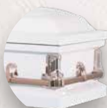
TC-5 White Pink Crepe