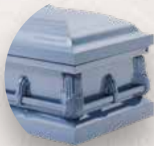
SS-30M Light Blue Blue Crepe