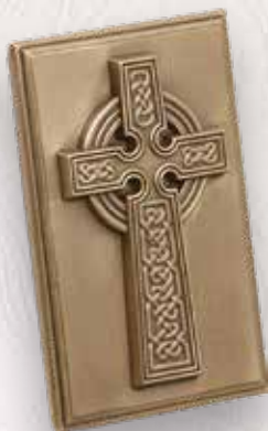
VC-11 Celtic Cross