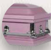
MC-66 Orchid / Silver Pink Crepe