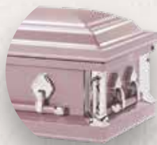
A-12 Orchid Pink Crepe