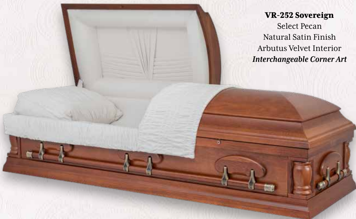
VR-252 Sovereign Select Pecan Natural Satin Finish Arbutus Velvet Interior Interchangeable Corner Art