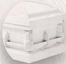
SS-40M White Pink Crepe