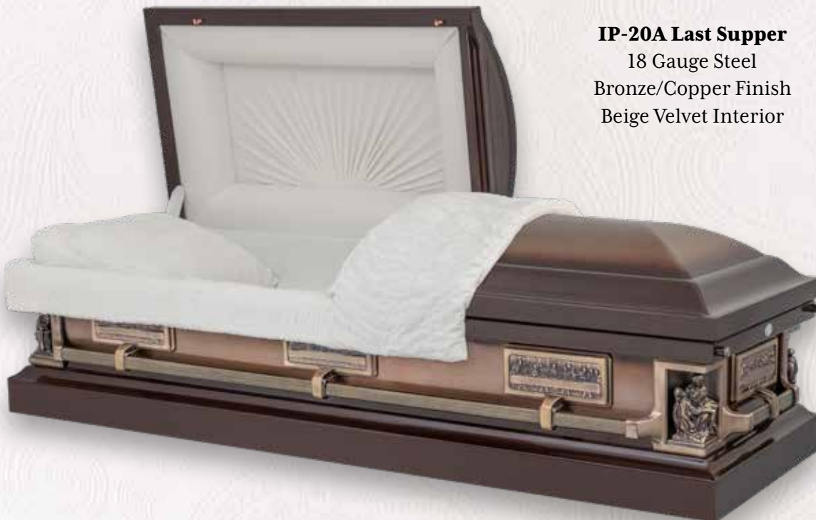
IP-20A Last Supper

18 Gauge Steel Brushed Copper/Orchid Finish Pink Crepe Interior