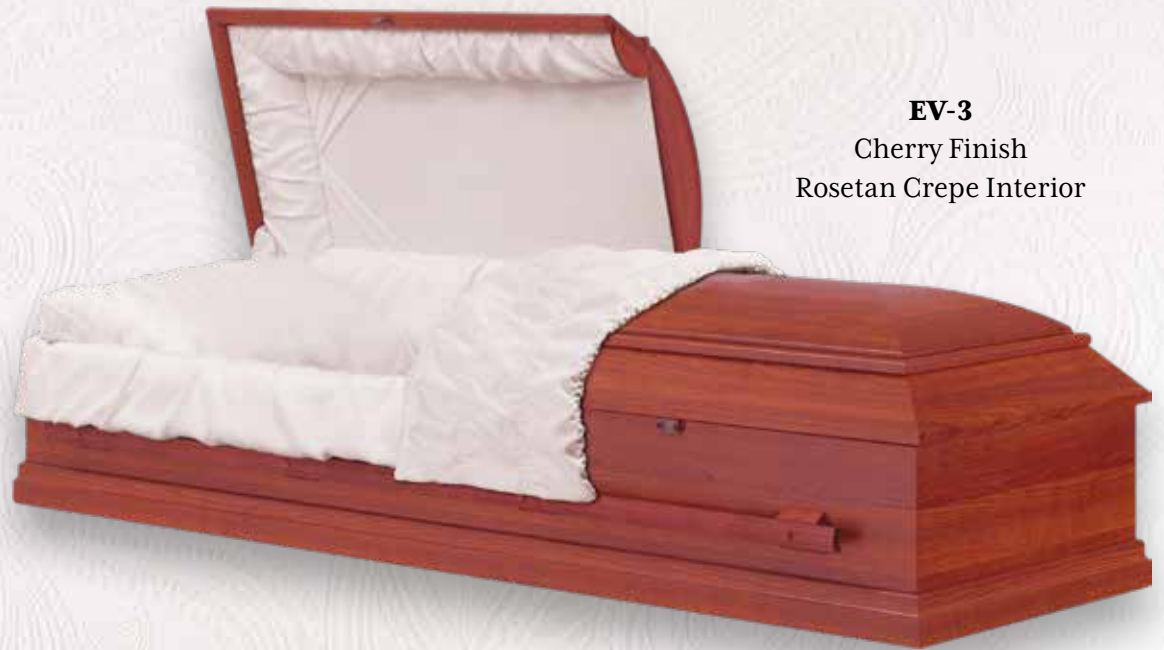
EV-3 Cherry Finish Rosetan Crepe Interior