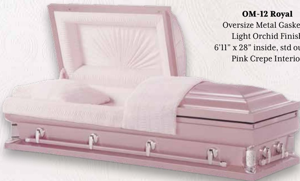
OM-12 Royal Oversize Metal Gasketed Light Orchid Finish 6'11" x 28" inside, std outside Pink Crepe Interior