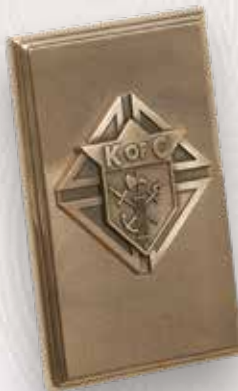
VC-15 Knights of Columbus