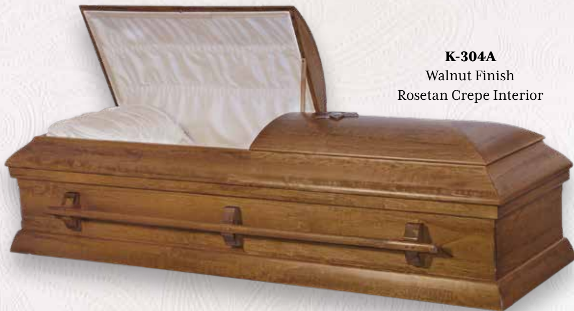
K-304A Walnut Finish Rosetan Crepe Interior