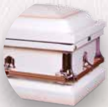
MC-62 White / Pink Pink Crepe