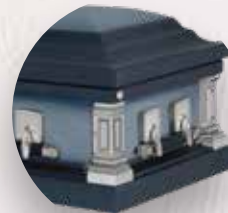
MC-23 Blue / Light Blue Blue Velvet