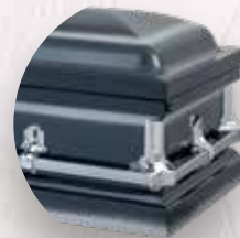
MC-67 Neo. Blue / Silver Blue Crepe