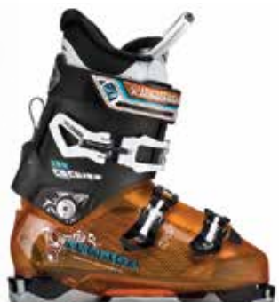
COCHISE 100 | flex 100, last 100mm