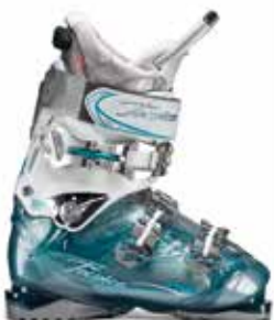
PHOENIX MAX 12 AIR W flex 90, last 102