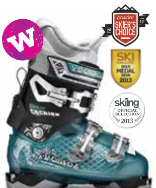
COCHISE W100 | flex 100, last 100mm