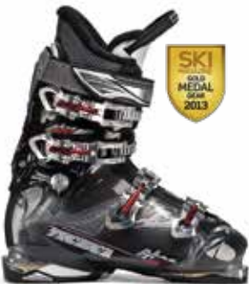
PHOENIX 120 HVL flex 120, last 106mm