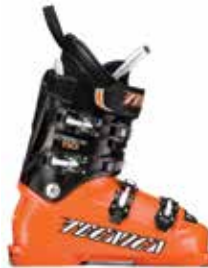
INFERNO 110 flex 110, last 98mm