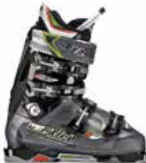
DEMON 120 flex 120, last 100mm