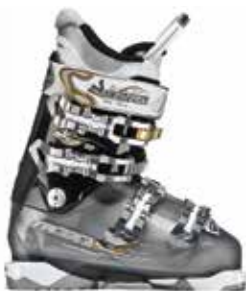
DEMON W90 flex 90, last 100mm