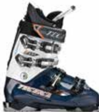
DEMON 100 flex 100, last 100mm