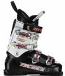
INFERNO HEAT flex 100, last 98mm