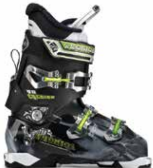
COCHISE 90 | flex 90, last 100mm