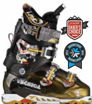
COCHISE 120 | flex 120, last 100mm