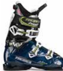
PHOENIX MAX 12 AIR flex 90, last 102mm