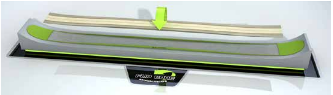
3D Woodcore is flipped upside down and exactly matches the rockered shape of the ski mold

We build the ski mold in exactly the finished shape of the ski (this is what is unique to our production process). We then layer in the components and press the ski with equal and consistent downward pressure. The shape (camber profile) of the ski is not manipulated or forced. This results in the production of skis that have very harmonic pressure distribution and very smooth, natural flex curves.