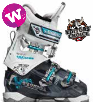
COCHISE W90 | flex 90, last 100mm

The cuff mobility system in the Cochise line of boots is hands down the best I have ever used. The locking mechanism is reliable and simple to use. When in ski mode, the metal to metal connection eliminates any slop making it the best skiing touring boot on the market! DAVE ROSENBERGER