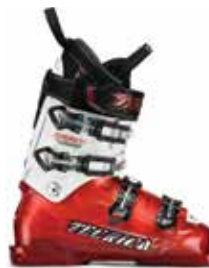
INFERNO BLAZE flex 110, last 98mm