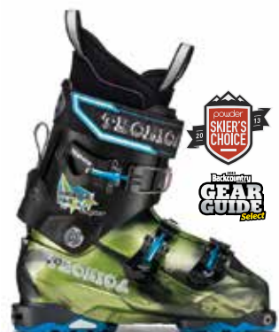
COCHISE PRO LIGHT | flex 120, last 100mm