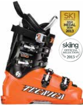
INFERNO 130 flex 130, last 98mm