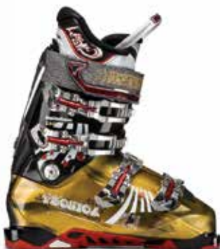
BODACIOUS | flex 130, last 98mm