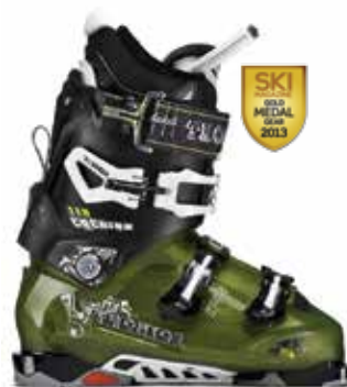
COCHISE 110 | flex 110, last 100mm