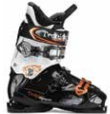
STAMPEDE flex 80, last 102mm