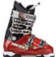
DEMON 90 flex 90, last 100mm