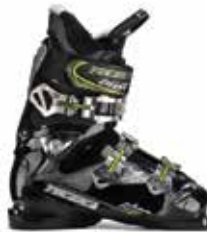
PHOENIX MAX 8 flex 80, last 102mm