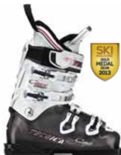
INFERNO CRUSH flex 100, last 98mm