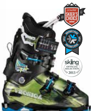
COCHISE PRO 130 | flex 130, last 98mm