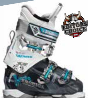
COCHISE W90 flex 90, last 100mm