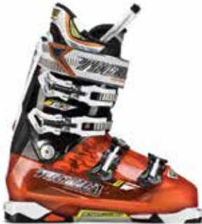
DEMON 130 flex 130, last 100mm