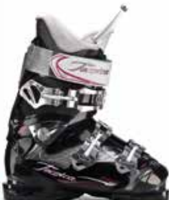
PHOENIX MAX 8 W flex 80, last 102mm