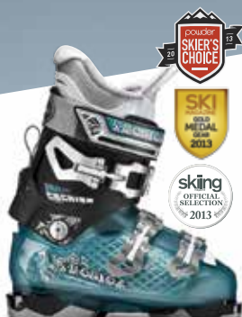
COCHISE W100 flex 100, last 100mm

The 50 girls in Keely’s Mount Hood racing camp in the summer of 2012 – from 11 states and Canada – got a full-immersion girl-power experience, living together in the big bunk rooms of the Mount Hood Academy House, starting their days on the mountain at 7 a.m., learning about skiing and themselves from each other and from some of the strongest women anywhere. The environment was powerful and empowering, by design. “We tell the girls to put all of themselves into everything they do,” says Keely. “To do it for the right reason. To be aggressive. To not worry about what the pretty pencil-thin girls think – they’re not athletic, and they don’t get ‘strong.’ We tell them to Boom! Carve! We help the girls rip.”