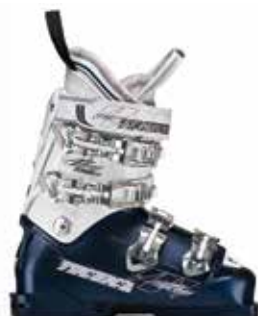
INFERNO FLING flex 90, last 98mm