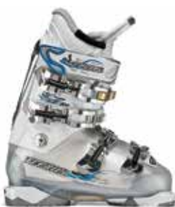
DEMON W100 flex 100, last 100mm