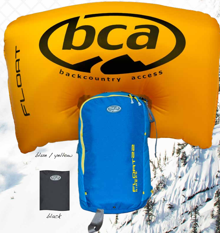
blue / yellow