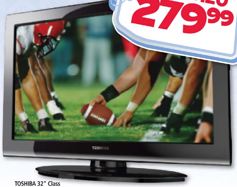
TOSHIBA 32" Class LCD 720p HDTV Reg. $399.99 2314-4937