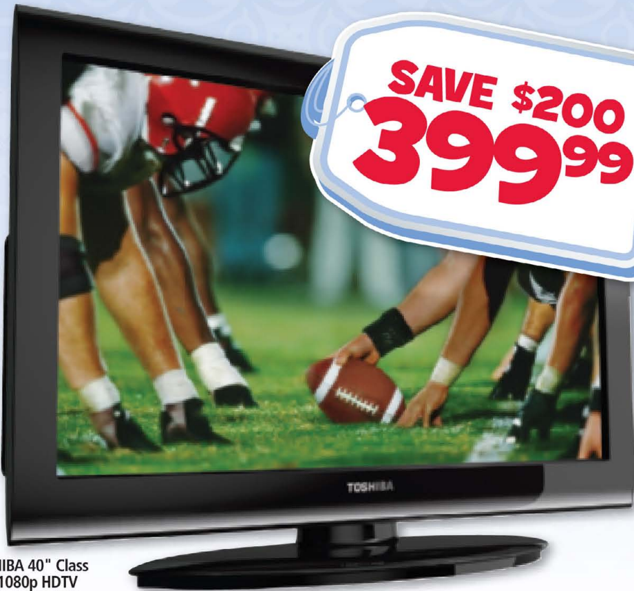
TOSHIBA 40" Class LCD 1080p HDTV Reg. $599.99 2318-0219

▼ Offer valid 11/25/11 thru 11/26/11 only. Limit one $15 reward per customer. Offer valid in store only. Limit 30 cards per store unless prohibited by law. Minimum purchase of one (1) $100 Visa gift card or one (1) $100 MasterCard gift card, before taxes, required. Customers may not purchase multiple Visa gift cards and/or MasterCard gift cards in denominations that cumulatively amount to $100 or more to meet the minimum purchase requirement. Activation fee will apply. Cannot be combined with any other offer. No Rain Checks, except as required by law. Subject to availability. See gift cards for additional details, terms, conditions and (if applicable) fees. All trademarks are property of their respective owners. The Visa gift card is issued by MetaBank(TM) pursuant to a license from Visa U.S.A. Inc. The MasterCard gift card is issued by U.S. Bank National Association, pursuant to a license from MasterCard International Incorporated. MasterCard and the MasterCard Brand Mark are registered trademarks of MasterCard International Incorporated.