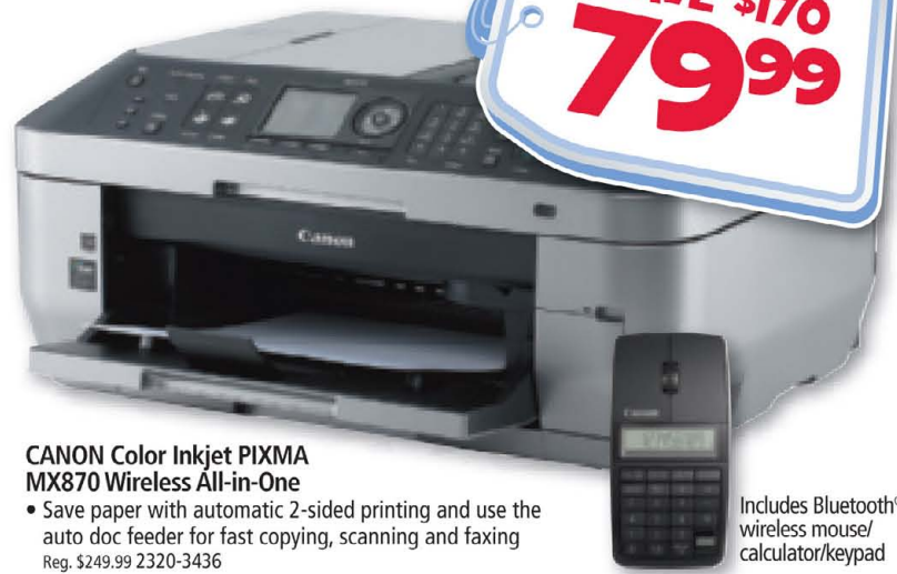
CANON Color Inkjet PIXMA MX870 Wireless All-in-One • Save paper with automatic 2-sided printing and use the auto doc feeder for fast copying, scanning and faxing Reg. $249.99 2320-3436

Includes Bluetooth® wireless mouse/calculator/keyboard