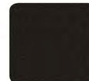
Crystal Black Silica