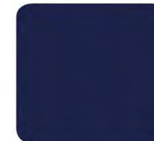
Deep Indigo Pearl