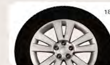
3.6R Premium and 3.6R Limited