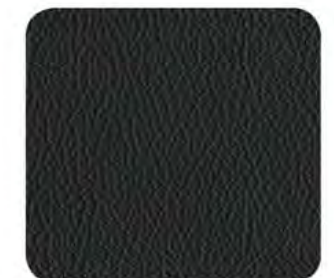
Slate Gray Leather (SGL)