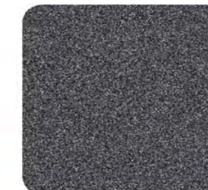
Graphite Gray Metallic