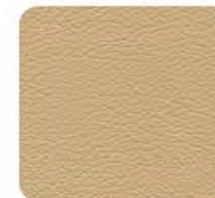
Desert Beige Leather (DBL)