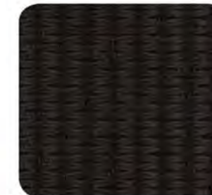
Slate Gray Cloth (SGC)