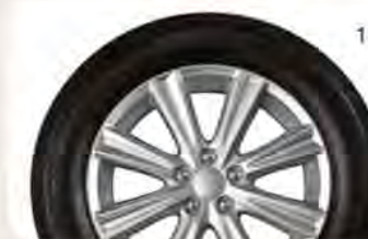
2.5i Premium and Alloy Wheel Package