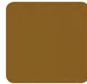
Caramel Bronze Pearl