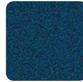
Deep Indigo Pearl