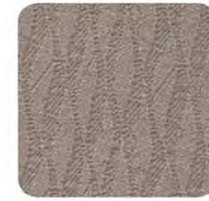
Warm Ivory Cloth (WIC)