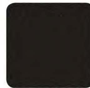
Crystal Black Silica