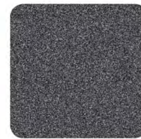
Graphite Gray Metallic