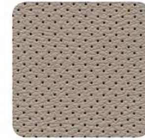
Warm Ivory Leather (WIL)