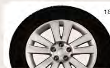
3.6R Premium and 3.6R Limited