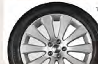
2.5i Limited and 3.6R models