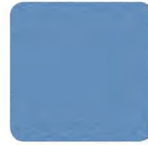
Sky Blue Metallic