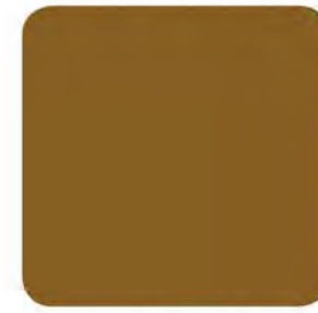
Caramel Bronze Pearl