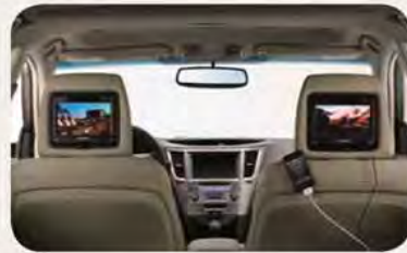
Rear Seat Entertainment System

Help protect the vehicle's paint finish from stones and road grime.