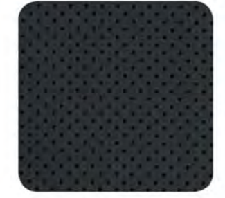
Off-Black Leather (OBL)