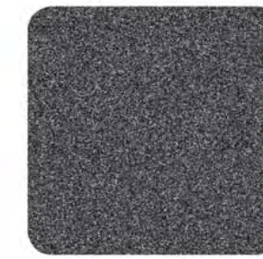
Graphite Gray Metallic