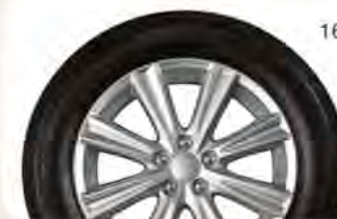
2.5i Premium and Alloy Wheel Package