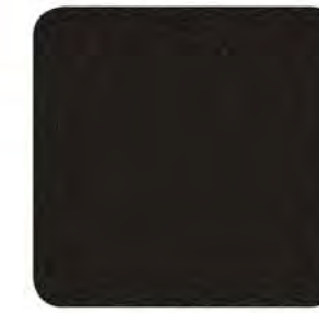
Crystal Black Silica