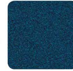
Deep Indigo Pearl