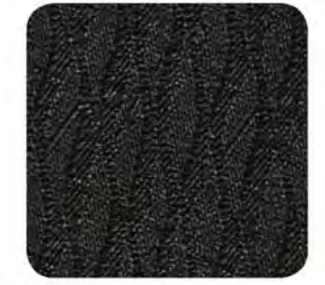
Off-Black Cloth (OBC)