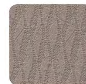
Warm Ivory Cloth (WIC)