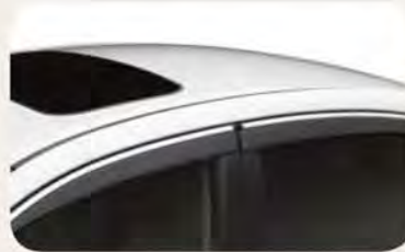
Side Window Deflectors

Casts a low and wide beam of light to enhance vision in inclement weather.