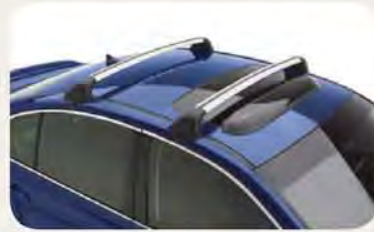
Crossbar Set Fixed – Sedan

May be used in conjunction with most Genuine Subaru roof attachments and carriers. Additional mounting clamps required.