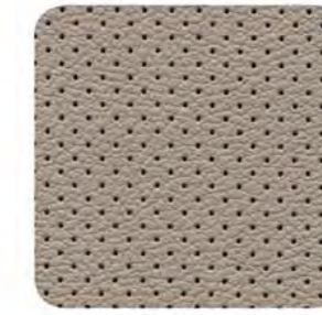
Warm Ivory Leather (WIL)