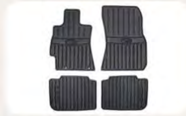
All-weather Floor Mats

May be used in conjunction with most Genuine Subaru roof attachments and carriers. Additional mounting clamps required.