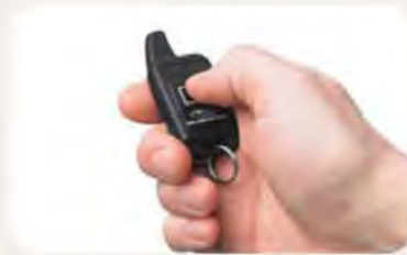
Remote Engine Starter

*Headphones are for rear passenger use only. **iPod accessory is not included.