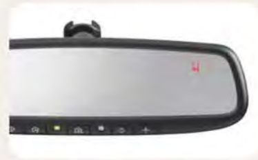
Auto-dimming Mirror with Compass and HomeLink®

Sleek, low-profile design adds just the right amount of attitude to your Legacy. Comes pre-painted and ready to install.