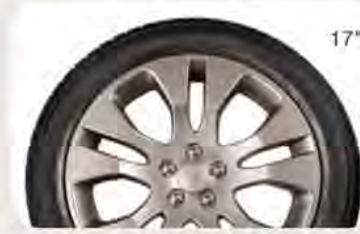
2.0i Sport Premium and 2.0i Sport Limited