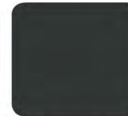
Obsidian Black Pearl