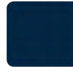
Marine Blue Pearl