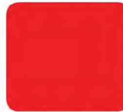
Deep Cherry Pearl