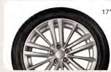
2.0i Limited and Alloy Wheel Package