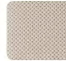
Ivory Tricot (IT)