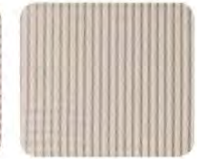
Ivory Striped Cloth (ISC)