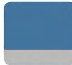
Sky Blue Metallic/ Ice Silver Metallic