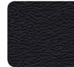
Black Leather (BL)