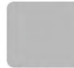
Ice Silver Metallic