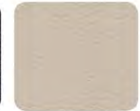
Ivory Leather (IL)