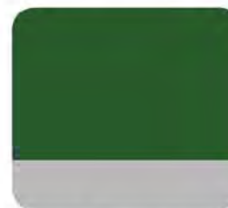
Sage Green Metallic/ Ice Silver Metallic