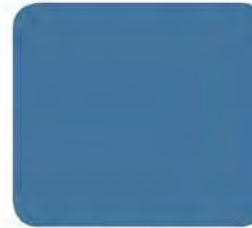
Sky Blue Metallic