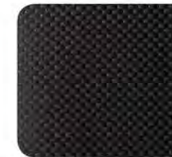
Black Tricot (BT)