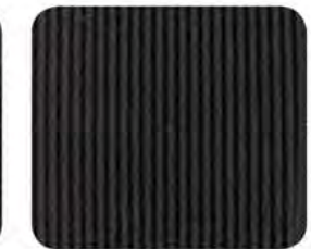
Black Striped Cloth (BSC)