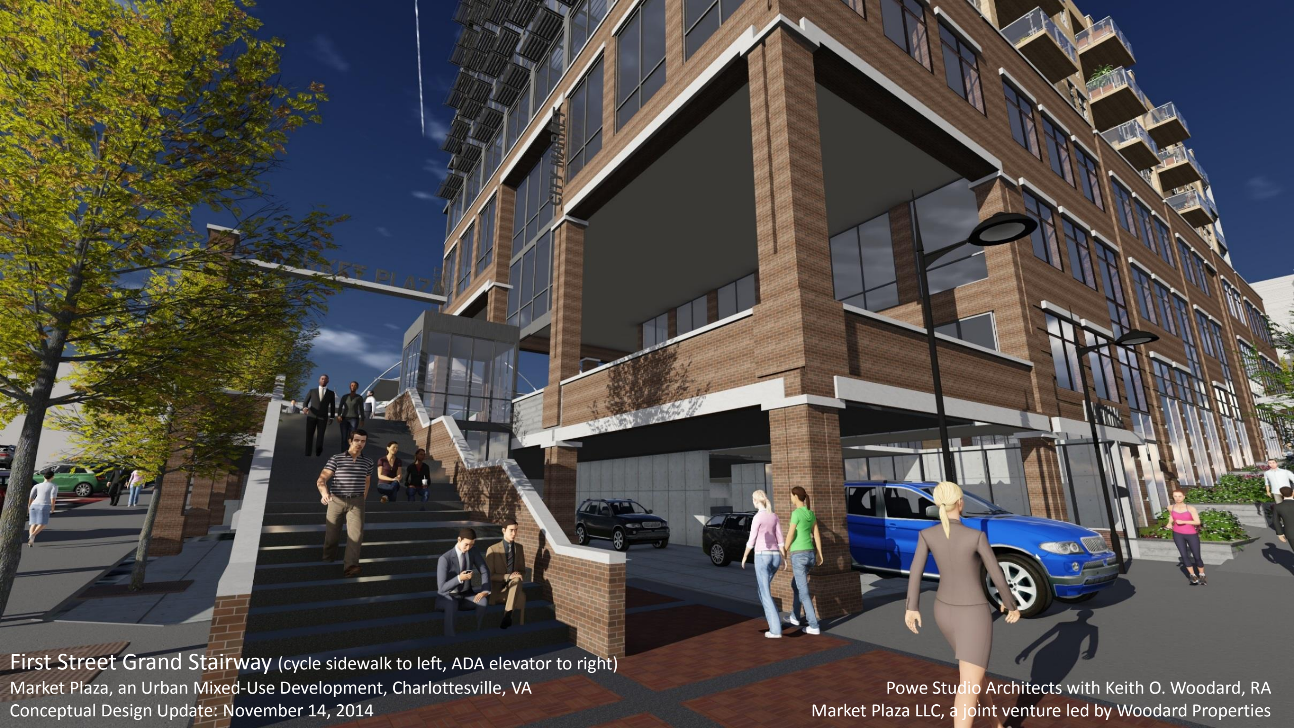
First Street Grand Stairway (cycle sidewalk to left, ADA elevator to right) Market Plaza, an Urban Mixed-Use Development, Charlottesville, VA Conceptual Design Update: November 14, 2014