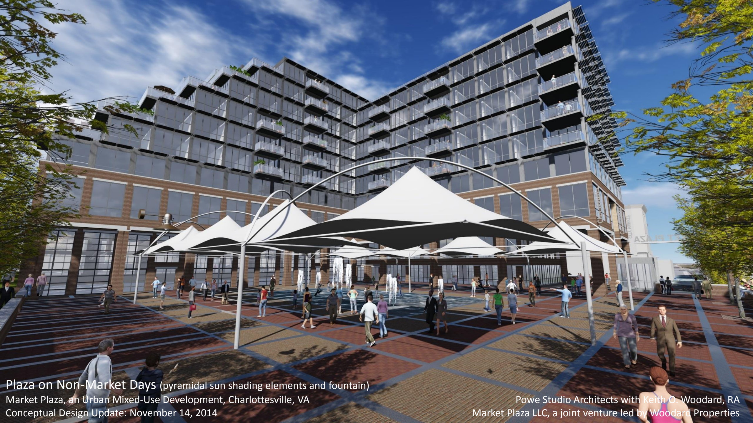
Plaza on Non-Market Days (pyramidal sun shading elements and fountain) Market Plaza, an Urban Mixed-Use Development, Charlottesville, VA Conceptual Design Update: November 14, 2014

Powe Studio Architects with Keith O. Woodard, RA Market Plaza LLC, a joint venture led by Woodard Properties