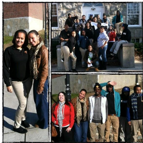
YouthBuild Providence Students visiting the URI campus

Later in the day, students enjoyed a great meal in URI's dining hall. Students were surprised by all of the available food options. After a long lunch, students were able to enjoy the full campus tour including the dorms, gyms and pool side area that URI has to offer. URI was a great experience for the students to get an insight on college choices. YouthBuild students were honored to visit and many left excited to apply!