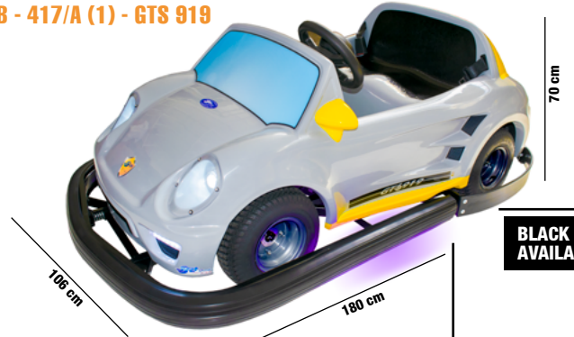
B-417/A (1) - GTS 919

F-417 (2) F-417 (3) F-417 (4) F-417 (5) F-417 (6) F-417 (6) F-417 (5)