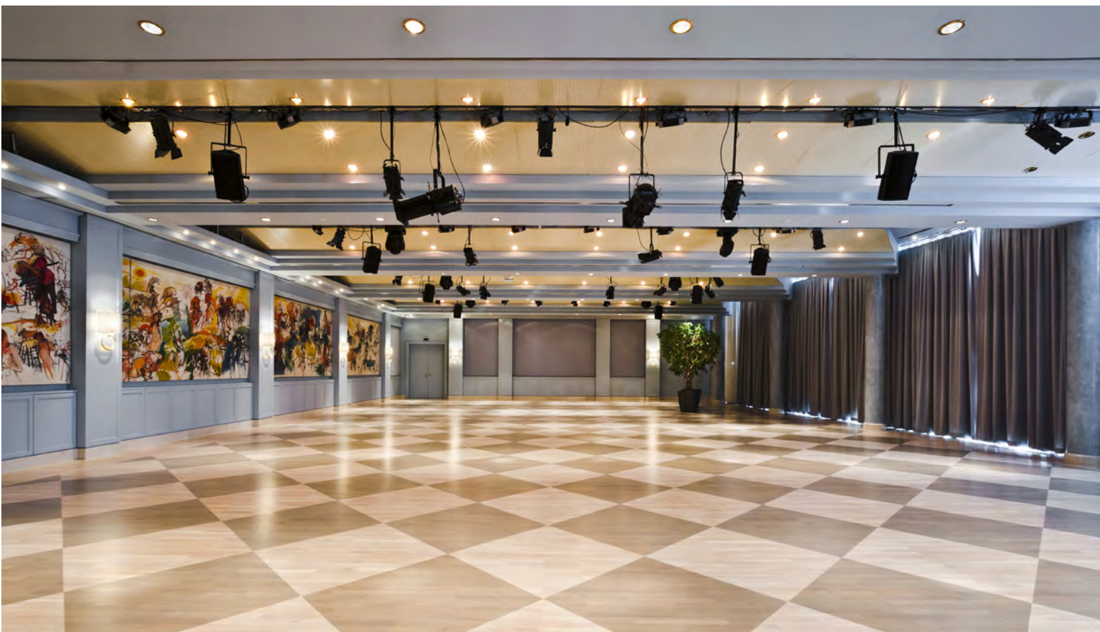
Conference space, Salzburg, Austria: Bona Craft Oil 2K (Frost and Ash) + Bona Traffic HD | Heavy wear