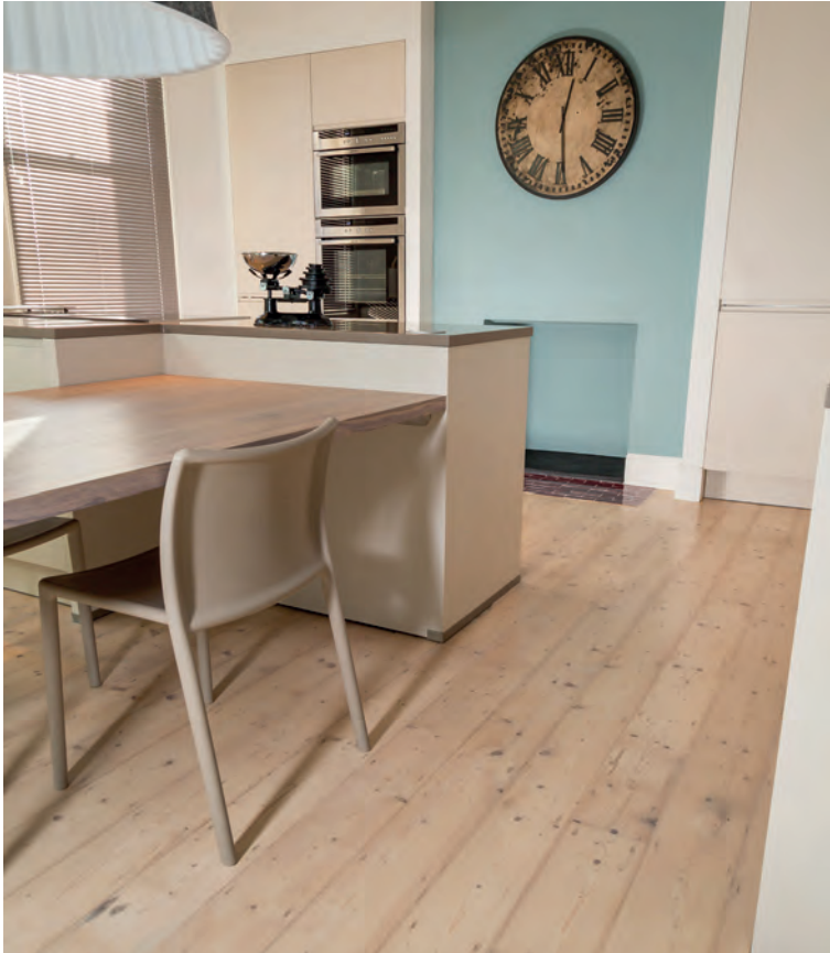
Private home, Bath, UK: Bona White + Bona Traffic HD | Heavy wear