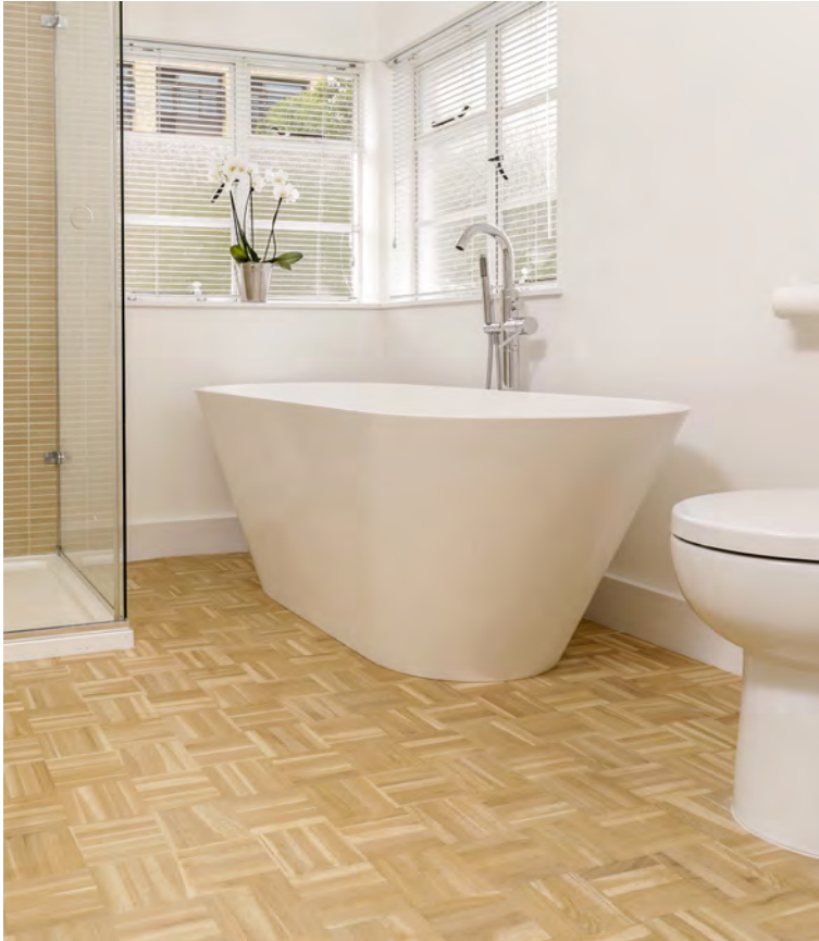
Private home, London, UK: Bona Natural + Bona Traffic Natural | Heavy wear