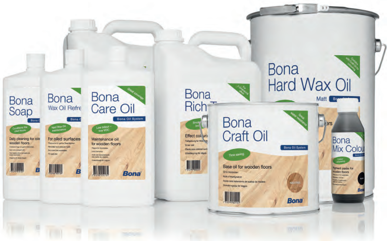
Bona Craft Oil 2K is part of the Bona Oil System

We are able to produce custom colours on request. Please speak to your Bona representative.