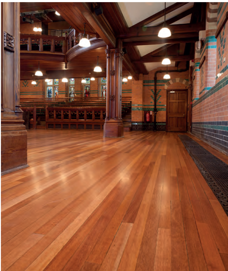
Princess Hall, Cheltenham Ladies College, UK: Bona Classic + Bona Traffic HD | Heavy wear