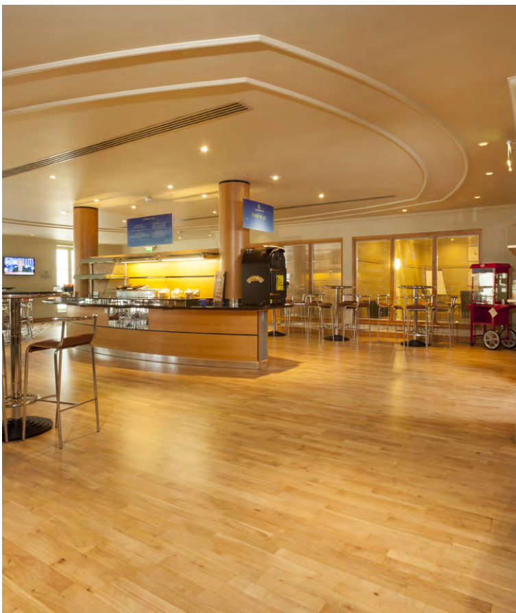
Hotel break out area, Leeds, UK: Bona Intense + Bona Traffic HD Anti Slip | Heavy wear