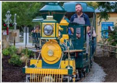
Electric C.P. Huntington Train