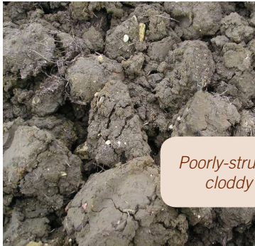
Poorly-structured, cloddy soil