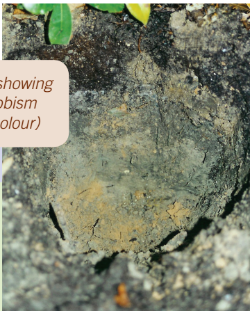
Trial pit showing anaerobism (grey colour)

Without structure, soils will suffer from anaerobism, waterlogging and nutrient lock-up and, ultimately, plants will die!