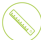
Multiple Sizes Available