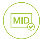
MID Approved Metering