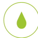
Optional Water Metering