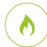
Optional Gas Metering