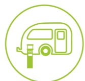
Touring Smart Metering