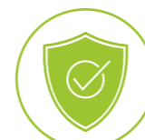
Strong & Durable