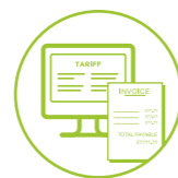
Computer Managed Metering Systems