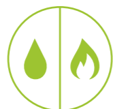
Water & Gas Metering Ready (via additional wireless sender unit)