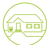
Residential Smart Metering