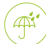
IP44/55 Weather Proof