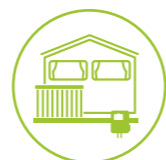
Static Smart Metering