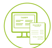
Park Operator Switching & Metering