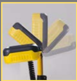
180° pivoting head