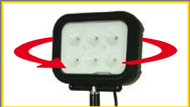
360° rotating head