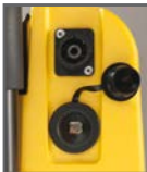
12V auxiliary outlet allows the user to power laptops, mobile phones etc.