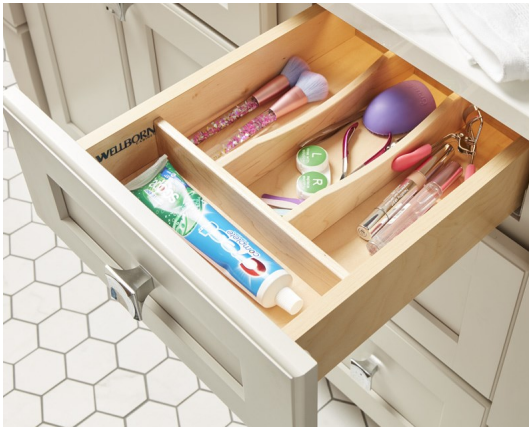
Shallow Drawer Divider in Solid Wood

The Gray Mist vanity is packed with organizational tools. Below the beautiful vessel sink, a Vanity Wastebasket is attached to the inside of the cabinet door to hide what would normally be an exposed trash can. To the right of that, the three drawers are outfitted with our solid wood dividers to make storing accessories and other bathroom supplies easier. The top is a shallow divider that is normally used in the kitchen as a cutlery tray; however, it has found new life in our bathroom by storing health and beauty supplies. The bottom two drawers are deeper for storing larger items. These dividers are trimmable and can be removed to accommodate virtually any toiletry item based on the size of the accessory.