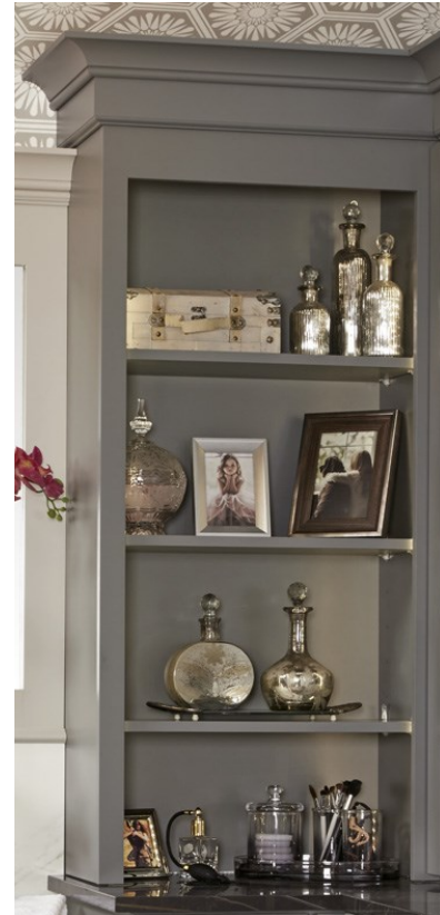
Bookcase with Flush Cabinet Left End