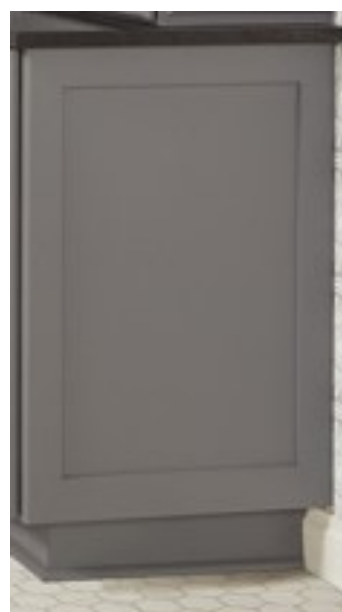
Matching End Base Panel

Wellborn Cabinet's New Applied Door Option is another way to provide matching ends to your cabinetry for a finished look.