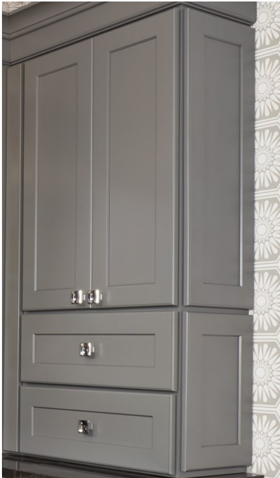
Wall Cabinet with Two Drawers

This Preston cabinet sits above two drawers that are both solid-wood with dovetail quality design. Each drawer is fitted with a deep drawer divider to provide ample storage and organization.