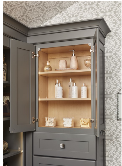
Wall Cabinet with Natural Interior

This Preston cabinet sits above two drawers that are both solid-wood with dovetail quality design. Each drawer is fitted with a deep drawer divider to provide ample storage and organization.