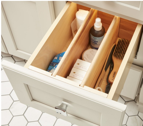
Deep Drawer Divider in Solid Wood