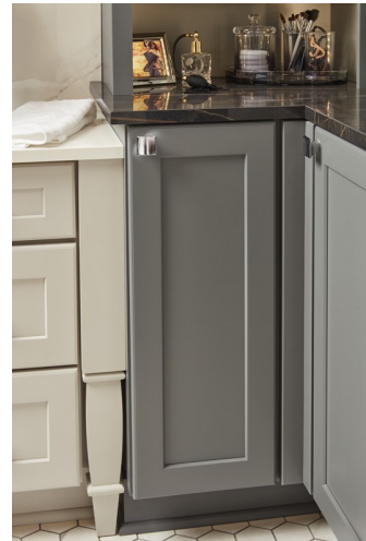
Preston Door Styles in Gray Mist (pictured left) and Willow (pictured right)

The Gray Mist Vanity is accented with a Flush Cabinet End, Base End Panels, and two turned legs. On the front, matching legs are placed to balance the area and fill space between the cabinets.