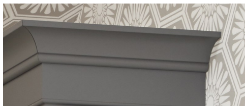
Large Cove Moulding topping Ogee Fascia Moulding