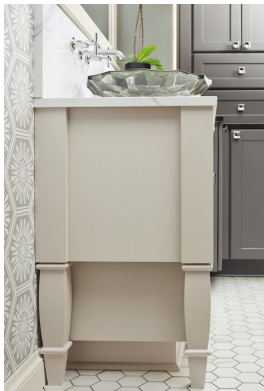
Flush Cabinet End and Base End Panel

The Gray Mist Vanity is accented with a Flush Cabinet End, Base End Panels, and two turned legs. On the front, matching legs are placed to balance the area and fill space between the cabinets.