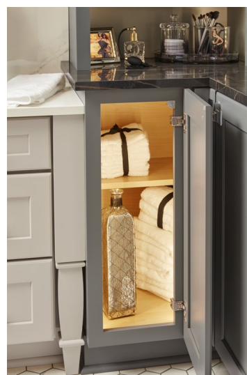
Deep Corner Cabinet

Wellborn Cabinet's New Applied Door Option is another way to provide matching ends to your cabinetry for a finished look.