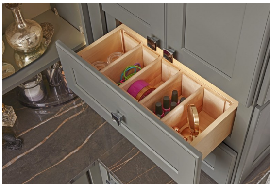
Deep Drawer Dividers in Natural Wood