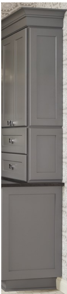
New Applied Door Option For Matching Ends

Below the Bookcase, a Deep Corner Cabinet with natural wood shelves provides plenty of storage for towels and larger toiletries.