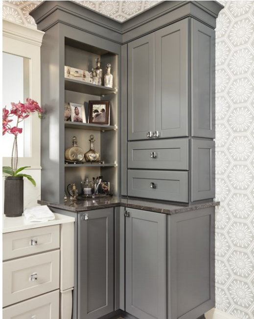
Preston door style Finished in Willow

The Preston door style is continued to the right side in a complementary gray Willow finish. Stylish modern chrome-colored hardware was chosen to merge the old to the new in this space. Soft-close doors and drawers provide quiet closure and further the life of the cabinetry. Deep cabinets provide plenty of space for storage in the corner area. Having a space to display and store sentimental items was important so a bookcase was included with matching shelves. LED Strip Lighting was installed to complete the bookcase. Flush cabinet ends, applied doors, and a matching vanity end panel complete the side and corner unit.