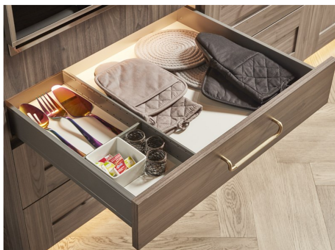
Superior Wide Utensil Divider

The three drawers under the oven offer easily accessible storage using metal drawer boxes. Matching metal Superior Wide Utensil Divider for storing pot and pan holders and other serving pieces can be found in the top drawer while directly below that, the Superior Deep Drawer Divider placed in the matching metal drawer creates a cleanly organized drawer.