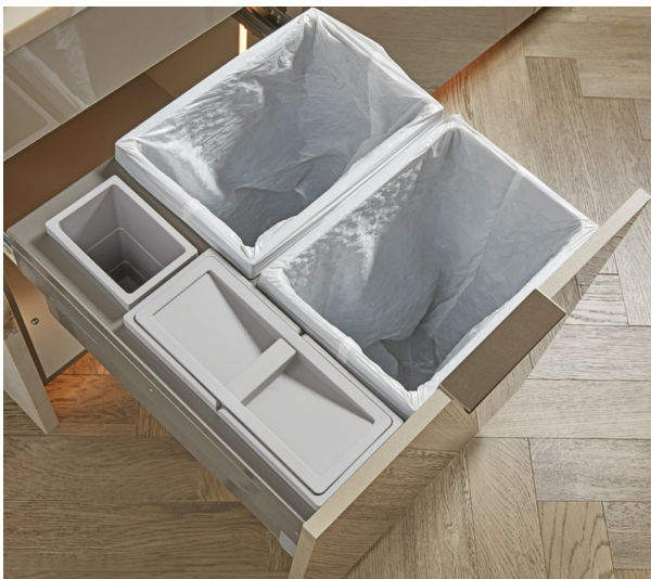
Push To Open Wastebasket Cabinet with Cover

A hidden surprise in this kitchen is the Push to Open wastebasket with dual trash cans and bonus storage for storing extra trash bags or recycling.