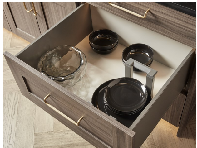
Superior Thick Plate Holder