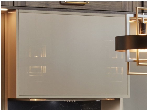
Serenity Gold Frame Sand Gloss Back Painted Glass

The hood vent above the stovetop on the back wall is hidden behind our Midtown door style in High Gloss Gold with Touch to Open Top Hinge cabinetry. When opened, there is access to the hood vent inside for hiding electrical, ventilation features, and even added storage. With the simple push of a button, it activates the slow self-closing feature for ease in the kitchen. Wall cabinets above the hood were increased to 18" deep to continue the flush look.