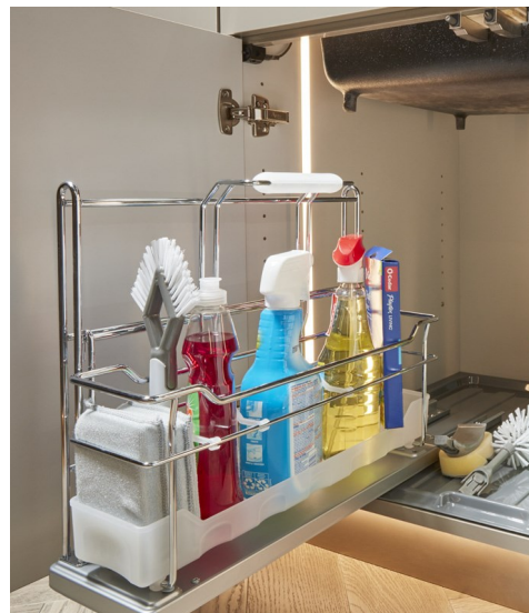
Superior Under-Sink Pull-Out Caddy

Combining grays and golds throughout the entire space from the hardware to the finishes, each piece in this kitchen works to create a modern space while staying true to our Wellborn Cabinet brand, marrying heirloom quality with technology to bring an active-living kitchen to life. Glamorous finishes combined with sleek modern cabinetry built with quality and seamless technology make this kitchen not only beautiful but functional.