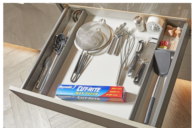
Superior Narrow Utensil Drawer