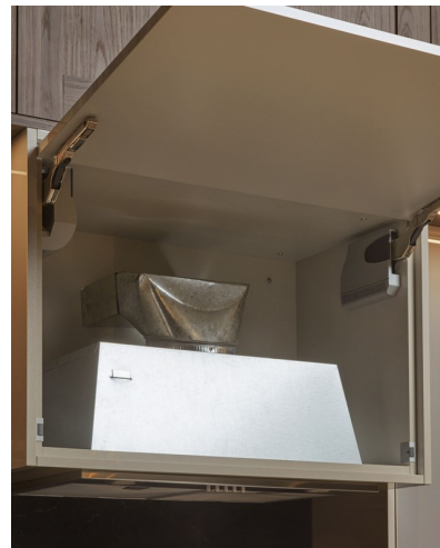
Wall Top Hinge Touch to Open Cabinet