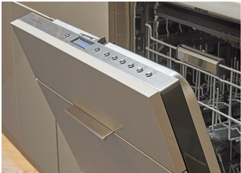
Dishwasher Panel Integrated Design with Blank-Front

Next to the sink, our Midtown door style has been used to cover the smart dishwasher and create a streamlined look with Wellborn's Custom Appliance Door Panels. A Blank-Front is integrated into the top of the design to create a seamless flow across the base cabinets.