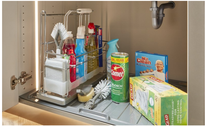
Gray Drip Tray Push to Open Prep for Lighting Strips

The interior of the cabinet has prep-for-lighting grooves in the sides of the cabinets providing a place for LED strip lighting. Interior lighting makes it easy to locate items that may be hard to find.