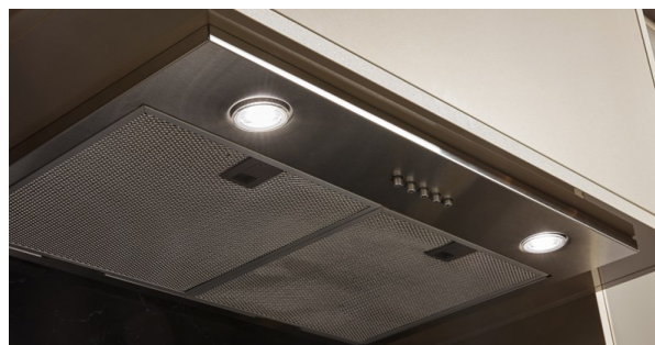
Vent-A-Hood Hood Vent