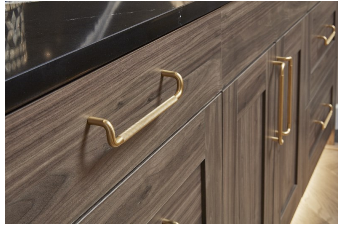
Gold Hardware on Doors and Drawers

Knurled hardware is a huge trend right now. Placed on the transitional Morristown doors, the gold hardware ties each element of the kitchen together.