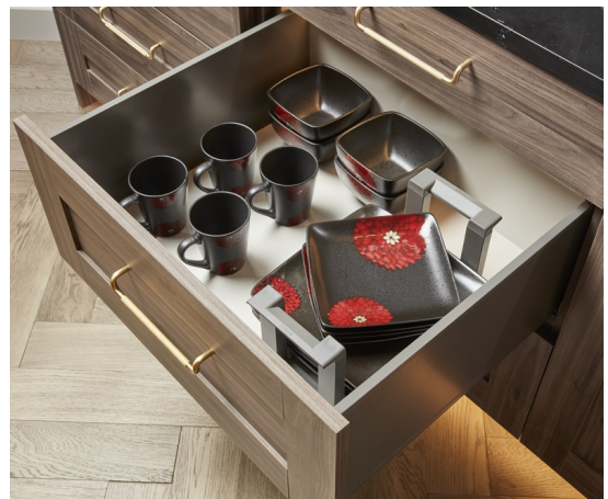
Superior Thick Plate Holder

The Superior plate holder helps keeps your plates organized and is capable of holding up to twelve plates. It is also adaptable so that it can be positioned in various parts of the drawer. The soft close feature on every drawer helps keep everything in its proper place in the drawers and helps to reduce noise in the kitchen.