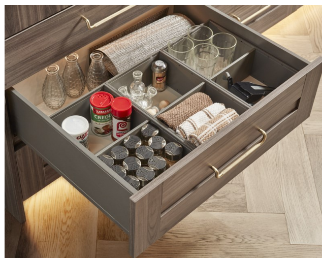
Superior Deep Drawer Divider