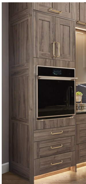
Single Oven Cabinet with Three Drawers