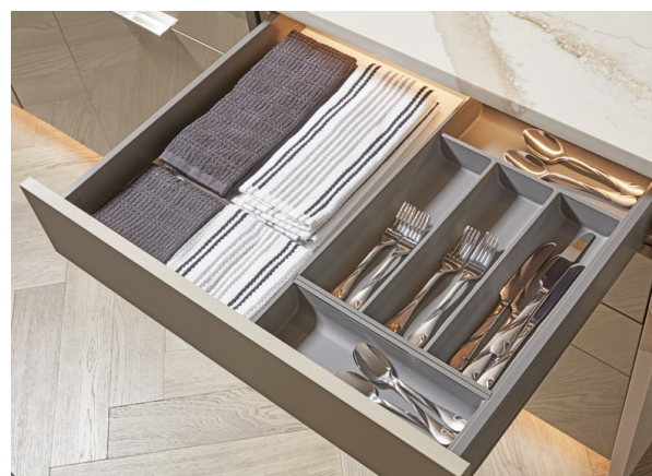
Superior Flatware Organizer