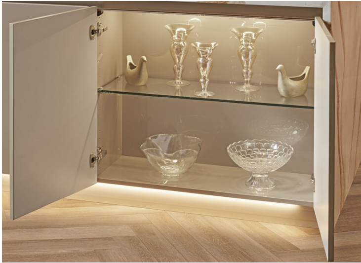
Aspire Midtown Door Style Gola Hardware

The island features our Aspire Midtown doors and drawers with specialized Gola satin nickel hardware for ease of opening, these doors provide a soft close as well as eliminating the need for exterior pulls creating a polished elegant look. Encased by a trendy quartz waterfall countertop, the front-facing cabinetry has LED Strip Lighting around the edges of the cabinets as well as puck lighting installed on the top of the cabinets for displaying items.. Each front facing cabinet on the island includes clear glass shelving and comes with a matching finished interior.