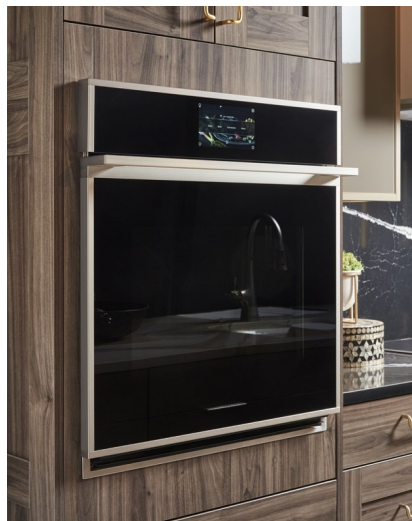
Oven Cabinet with Trimmable Panel