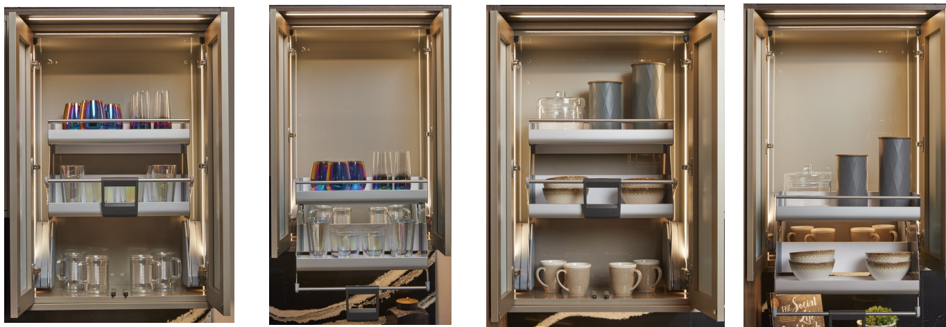
Easy Access Dynamic Shelving with Pull Down Handle

On either side of the hood vent cabinet door are two of our Push To Open Serenity Sand Gloss Back Painted Glass doors that coordinate well with the gray from the Smokey Walnut finish. Trimmed in gold, they hold our convenient Easy Access Dynamic Shelves with the pull-down system makes hard to reach items easier. The pull-down system is available in widths ranging from 21"-36" wide. Throughout the kitchen, we have placed LED lighting inside the finished interior of the cabinetry to aid in locating exactly what you need.