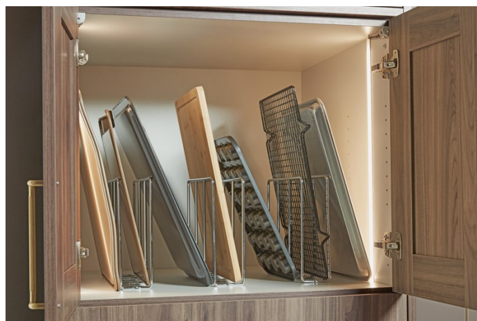
U-Shaped Metal Tray Divider

Located just above the oven, this space is customized with metal tray dividers. The dividers are U-shaped to help hold items in place. They can be placed prior to installation to be as wide or as narrow as needed to accommodate cutting boards, baking racks, or cooking sheets.