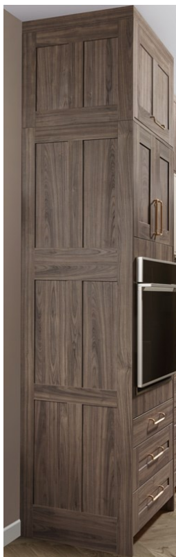
Matching Tall and Wall End Panels