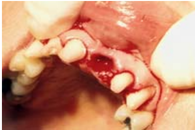
Figure 2. Atraumatic nonsurgical extraction, tooth No. 9.

Blood pressure was recorded at 120/60 and the pulse was 65 bpm. Premedication consisted of dexamethasone 9 mg orally (this was taken the morning of the procedure to coincide with the body's peak steroid level). The dexamethasone would continue for 2 more days with dosages of 6 mg and then 3 mg, respectively. A 2-g dose of amoxicillin was taken 1 hour prior to the appointment, subsequently followed by 500 mg tid for 7 days. Also, 800 mg of ibuprofen was taken 1 hour prior to the appointment. Three carpules of lidocaine 1/100,000 were administered via infiltration from teeth Nos. 6 through 11. The existing crowns were removed from teeth Nos. 7, 8, and 10, then teeth Nos. 6 through 11 were prepared for new crowns.