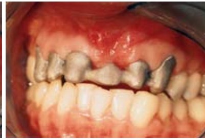
Figure 11. Metal frame try-in of fixed partial denture at 3 months post graft.