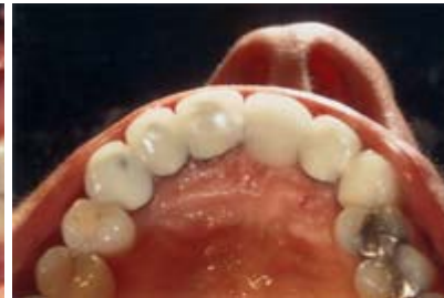
Figure 13. Lingual view of final prosthesis showing close adaptation of final prosthesis to ridge.

Primary closure of the surgical site both maintains the graft material and protects the site from exogenous bacteria. Primary closure was obtained through scoring of the periosteum and subsequent expansion with Metzenbaum scissors. Figure 7 shows checking of the flap for closure without tension. A collagen membrane (Biomend-Extend, Sulzer Dental) was utilized for exclusion of non-osteogenic cells from the graft site. The advantages of a membrane also include containment of the graft material and protection of the graft site in the case of incision line opening. A collagen resorbable membrane was chosen because of its handling characteristics, kindness to adjacent tissue, and avoidance of a second surgery. Further advantages of the collagen membranes are the chemotaxis offered for fibroblasts, the barrier effect for migrating epithelial cells, and the platelet aggregation they offer. 3 Figure 8 shows the collagen membrane being placed. Gortex (polytetrafluoroethylene) sutures were utilized in an interrupted manner (Figure 9) to obtain primary closure. An acrylic temporary prosthesis was constructed, with consideration to creating an ovate pontic form.