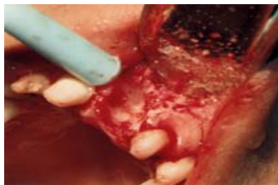
Figure 6. Extraction site condition after decortication with adequate bleeding observed.

DFDBA putty (Grafton, Osteotech, Inc) was chosen after discussion with the patient revealed that she did not want a second site surgery. It was explained to the patient that autogenous bone via a block graft was more predictable. The DFDBA putty was the next best choice because it offers osteoconductive, osteoinductive, and space-maintaining potential without the necessity of a second site surgery. The DFDBA putty also offers ease of handling and reduced migration of material compared with particulate materials. 2 Osteoconduction is bone growth from surrounding bone. Osteoconductive materials are biocompatible, but will not grow bone without adjacent bone cells to assist. Osteoconductive materials act as a biocompatible scaffold. Osteoinductive grafting materials create bone growth from osteoprogenitor cells under the influence of inducing agents from the host bone matrix. 1 Figure 6 shows the extraction site preparation after recontouring with the Brassler H71 and the RAP.