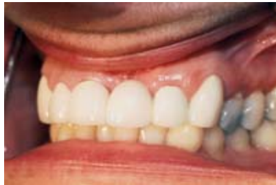
Figure 12. Delivery of final prosthesis, prior to bleaching of remaining teeth and replacement of restoration on tooth No. 12.