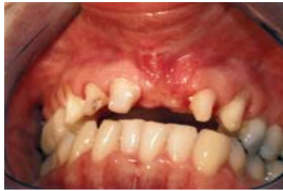
Figure 10. Healing of graft at 4 weeks.