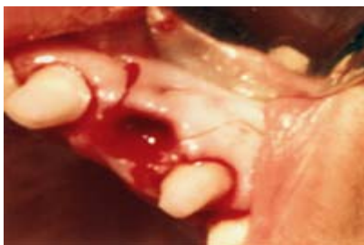
Figure 3. Papilla sparing incisions, offering a broad base flap with increased blood supply.

Atraumatic extraction techniques include the use of periostomes, sectioning a tooth, orthodontic extraction, and forcep rotation. When all the walls of bone around a tooth are left intact, the grafting material is better contained, osteoprogenitor cells are more readily available, and immobilization of the graft is obtained more easily. These factors affect choice of grafting material, membrane necessity, provisionalization options for the graft area, and healing time. Factors that determine the remaining walls of bone are severity of infection present, anatomic variability, and the extraction technique utilized. Evaluation of the remaining walls of bone is the starting point to successfully graft an extraction site.