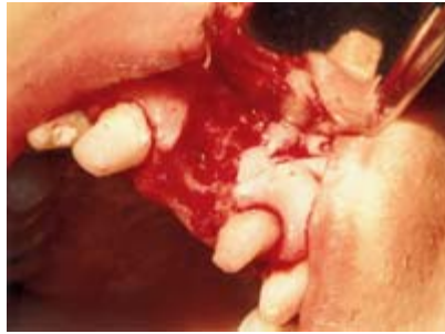
Figure 4. Flap reflection revealing extensive destruction of the buccal plate from external resorption.