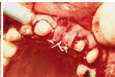
Figure 9. PTFE interrupted sutures placed.