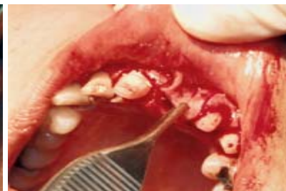
Figure 7. Checking flap for tension-free closure after scoring the periosteum and expansion with Metzenbaum scissors.