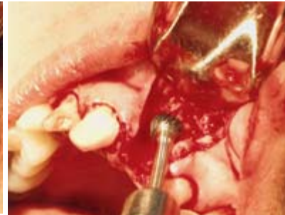
Figure 5. Decortication of surgical site to induce bleeding and growth factors.

Flap reflection utilizing a Molt curette revealed extensive destruction of the buccal plate (Figure 4). In order to offer osteogenic pleuripotential cells via a blood supply to the graft site, the graft site was contoured using a Brassler H71 Bur with sterile saline irrigation (Figure 5). This bur-induced decortication offers improved graft integration. The graft site was further decorticated with a straight bur to enhance the regional acceleratory phenomenon (RAP). 1 The RAP improves integration of the graft blood supply. The recipient graft site is ready to receive the grafting material of choice.