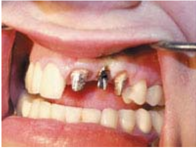
Figure 11. Two weeks after dental implant uncovering, ready for final impression.

retained fixed prosthesis should be considered. The advantages of a cement-retained prosthesis versus a screw-retained prosthesis include fewer components, no loosening of the screws, reduced occurrence of porcelain breakage in areas of occlusal contact, and less shear force on multiunit prostheses. 18 The choice of an implant abutment is determined in part during presurgical planning. If a case is planned ideally, a straight abutment with an aesthetic margin can be used. If bone or soft tissue is inadequate, an angled abutment will likely be needed. The use of an angled abutment creates potentially detrimental forces on an implant and should be avoided if possible. If adequate keratinized tissue is present, margins that resist recession are ideal. Following the guidelines outlined in the article, the final prosthesis of the case presented is shown (Figure 12).