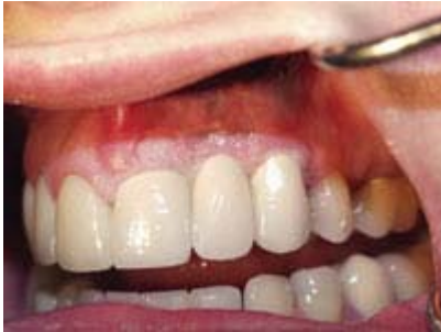
Figure 12. Final restoration of No. 10.

retained fixed prosthesis should be considered. The advantages of a cement-retained prosthesis versus a screw-retained prosthesis include fewer components, no loosening of the screws, reduced occurrence of porcelain breakage in areas of occlusal contact, and less shear force on multiunit prostheses. 18 The choice of an implant abutment is determined in part during presurgical planning. If a case is planned ideally, a straight abutment with an aesthetic margin can be used. If bone or soft tissue is inadequate, an angled abutment will likely be needed. The use of an angled abutment creates potentially detrimental forces on an implant and should be avoided if possible. If adequate keratinized tissue is present, margins that resist recession are ideal. Following the guidelines outlined in the article, the final prosthesis of the case presented is shown (Figure 12).