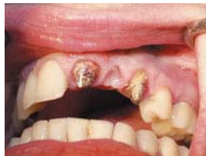
Figure 6. No. 10 area prior to implant placement, correct form of hard and soft tissue from previous graft.

The correct surgical placement of a dental implant is mandatory to obtain the ideal aesthetic result. Only through proper treatment planning can the correct position and number of implants be determined. Before surgical placement of a dental implant, the adequate hard and soft tissue must be available. If either hard or soft tissue is deficient, then grafting must occur prior to surgical placement of the implant. If grafting is to occur, then a conservative flap approach to preserve the vascular supply should be