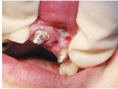
Figure 4. Three weeks postextraction of No. 10. Clinical evidence of missing buccal plate. Bone grafting required prior to dental implant placement.

radiograph indicating need for bone grafting prior to implant placement. Bone will support adjacent soft tissue and implant.