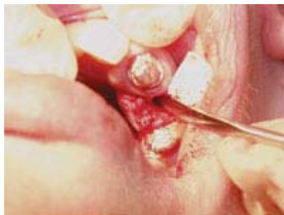
Figure 5. Bone grafting of extraction site of No. 10 utilizing a resorbable membrane. A conservative flap procedure was used to preserve the blood supply.