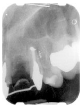
Figure 3. Periapical

Often, radiopaque guide stents are used with a CT scan to define tooth position better. Observing the final tooth position in relation to the existing osseous architecture allows decisions to be reached with respect to the need for osseous grafting. This prosthetic relationship on a CT scan also may help determine if a removable prosthesis is needed to support the maxillary lip. If a large discrepancy on a CT exists between the final tooth position and the existing bone, then lip support via a denture flange may be indicated. The existing osseous architecture visualized on a CT scan can also indicate soft-tissue support. This support is essential in the aesthetic zone, since the presence of papillae will be dictated in part by the osseous support around a dental implant as well as by the distance between implants. 18 Tarnow has suggested that unless there is a distance of 5 mm or less between the osseous crest of bone and the interproximal prosthetic contact point, papillae formation between crowns will be compromised. 11 Therefore, it may be necessary to perform a bone graft prior to implant placement in order to achieve a more predictable aesthetic result (Figure 3).