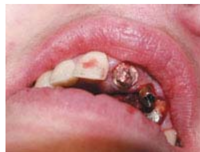
Figure 8. Conservative flap during dental implant placement in anterior maxilla preserves the blood supply.

During preparation of the osteotomy, care must be taken not to create excessive heat, which can lead to necrosis of bone. A bur speed of 2,500 rpm, sharp osteotomy burs, copious irrigation, and sequential preparation of the osteotomy site can help reduce iatrogenic effects on bone during osteotomy preparation. 16 In less dense bone, osteotomes and other bone manipulation techniques can be used in implant placement. Osteotomes can compress bone that is less dense, creating both an osteotomy preparation and increased density of the bone. It is also essential that adequate bone buccal to the dental implant is present. Often the dental implant is placed in a slightly lingual direction so that bone is present to the buccal of the implant. This aids in implant stability and soft-tissue coverage. Therefore, preoperative diagnosis and planning is essential. Further, if a mucoperiosteal flap is raised for osteotomy preparation, maintenance of the blood supply must be considered. Papillae-sparing incisions and broad-based, full-thickness flaps minimize aesthetic problems (Figure 8). Suturing techniques that ensure primary closure and a stable tissue position are important.