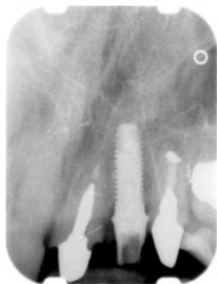
Figure 7. Correct spacing of dental implant to adjacent teeth allows for osseous support of interdental papillae.

considered (Figure 5). As noted, the interproximal osseous height should be within 5 mm of the proposed contact point, and adequate soft tissue should be present prior to surgical placement of the implants (Figure 6). Often, ovate pontics are utilized to form the soft-tissue bed prior to implant placement. An ovate pontic shape can be prepared through a provisional restoration or through tissue-sculpting techniques. The advantages of an ovate pontic are numerous and include improved oral hygiene and aesthetics. 14