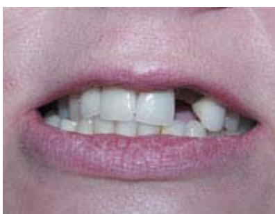
Figure 1. A 43-year-old female patient missing left lateral incisor.

The use of dental implants in the maxillary anterior region to replace missing teeth is a viable treatment option (Figure 1). There are many benefits of fixed dental implant-supported prosthetics versus traditional crown and bridge or removable tooth-borne prosthetics. 1 Maintenance of residual bone, ease of oral hygiene, increased longevity, and noninvolvement of adjacent teeth are a few advantages of using dental implants. In order to provide successful and aesthetic dental implant treatment, certain clinical parameters must be met. This is particularly true in the anterior maxilla, where the teeth and their supporting structures are readily visible.