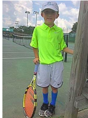
Cooper's First Tournament