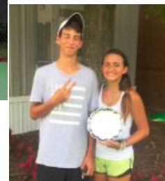
The Koch Family