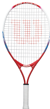
US Open 23" WRT21020U