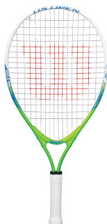
US Open 21" WRT21010U