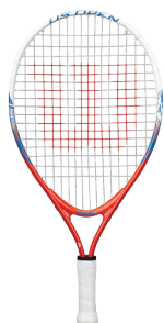
US Open 19" WRT21000U