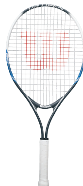
US Open 25" WRT21030U