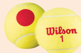
US Open Red Tournament Ball For ages 8 & under WRT137600 3 ball can