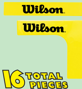
EZ Tennis Court Lines Use as boundaries, targets, visual aids, 12 lines, 4 corners. WRZ2573