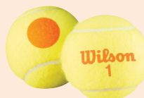
US Open Orange Tournament Ball For ages 9 - 10 WRT137700 3 ball can