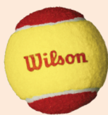
US Open Red Ball For ages 8 & under WRT13710B 36 ball bulk pack