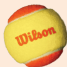
US Open Orange Ball For ages 9 - 10 WRT13720B 48 ball bulk pack