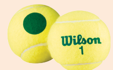
US Open Green Tournament Ball For ages 11 & over WRT137500 3 ball can