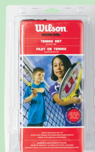
20' Home Tennis Net Quick and easy set-up. Great for driveway use. No poles or frame, easily secures with 10' ropes on either side WRZ2258000