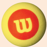
Starter Foam Ball For ages 8 & under WRZ259800 6 pack