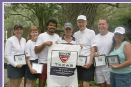
Senior Mixed 8.0-Corpus Christi