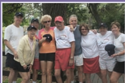
Senior Mixed 6.0-San Antonio