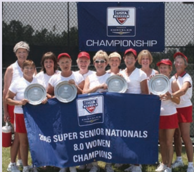
San Antonio-National Champions