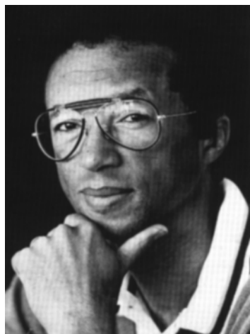
Arthur Ashe - 1943-1993 National Junior Tennis League Co-founder

For every hour spent on the playing field, two should be spent with a book. ~Arthur Ashe